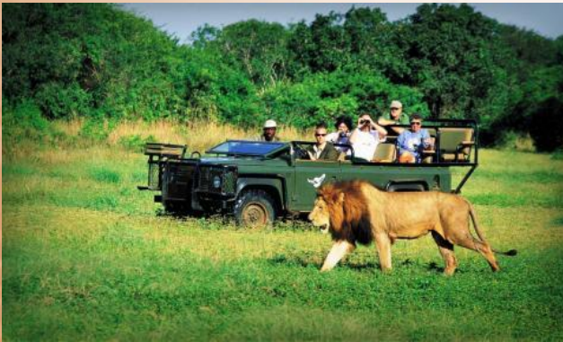
Great Safari Opportunities

Breathtaking experiences and captivating activities await you!