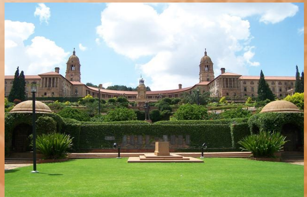
Inspiring Political History