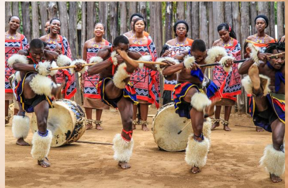
Fantastic Cultural Experiences