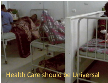
Health Care should be Universal