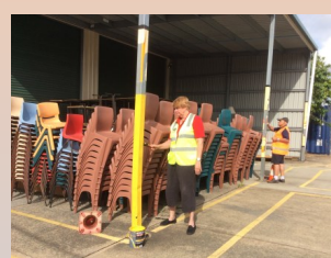
Examples of Furniture available at Donations in Kind