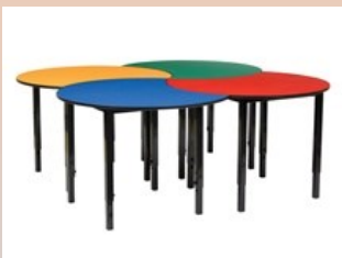
Examples of Flexible Furniture

Gone are the days when school desks were placed in a line with the students facing the blackboard. Schools are now changing to use Flexible Learning Furniture that can be arranged in various configurations allowing the students to work in groups or individually.