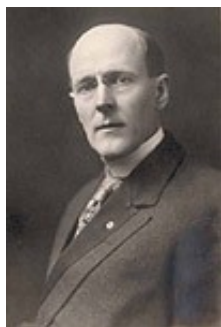
Paul Harris 1868-1947