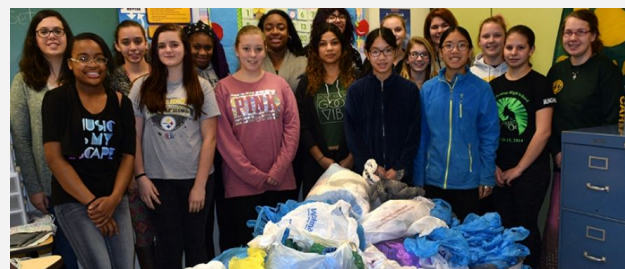
Plastic bag collection for Saint Elizabeth Ann Seton Parish crochet mats Winter 2017