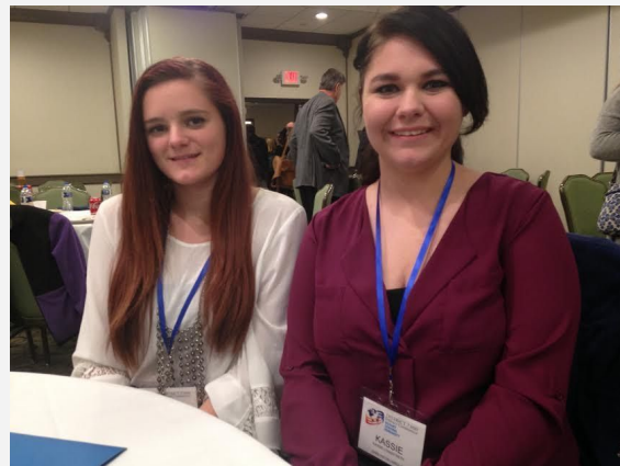
Interact Club Conference Fall 2016

In February we held a plastic grocery bag competition between over 3,000 bags! Carnegie Elementary also helped to collect bags. We then joined the ladies of Saint Elizabeth Ann Seton Parish in Carnegie to learn how to cut and crochet the bags into mats. We also made fleece blankets with their help. These items were donated to a homeless shelter. Currently, we are collecting shoes for children in Nicaragua.