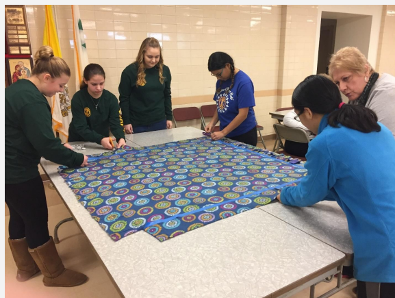
Making Fleece Blankets with St Elizabeth Ann Seton Parish Winter 2017