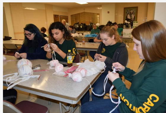
Crocheting plastic grocery bags into mats for the homeless with St Elizabeth Ann Seton Parish February 2017