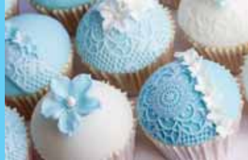
4 Large Cupcakes, 4 Flavors, 4 Techniques, 1 Adult Beverage (Champagne/Wine), and all the fun you can handle! Only $20!

Learn to Decorate Cupcakes Like a Pro with Dough Girl Cakes!