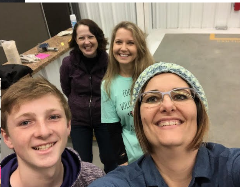
Back then the four of us