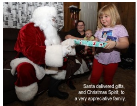
Santa delivered gifts, and Christmas Spirit, to a very appreciative family.