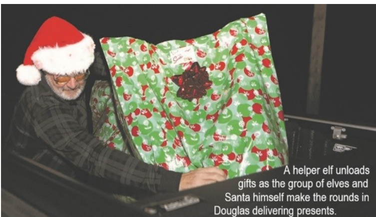
A helper elf unloads gifts as the group of elves and Santa himself make the rounds in Douglas delivering presents.