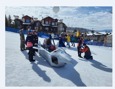
Kids Flew This One!