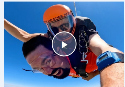
Phil skydiving videos