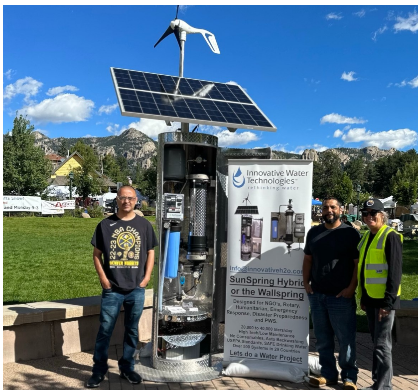
Solar and Wind Powered SunSpring™ Hybrid water purification system