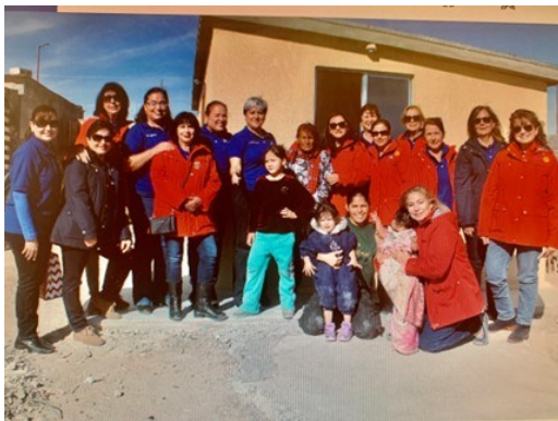
Photo of completed home with recipient family and members of the Rotary Club Rotario Campestre

homes, providing these students experience and education in the construction trades. Both Interact and Rotaract members have also been involved.