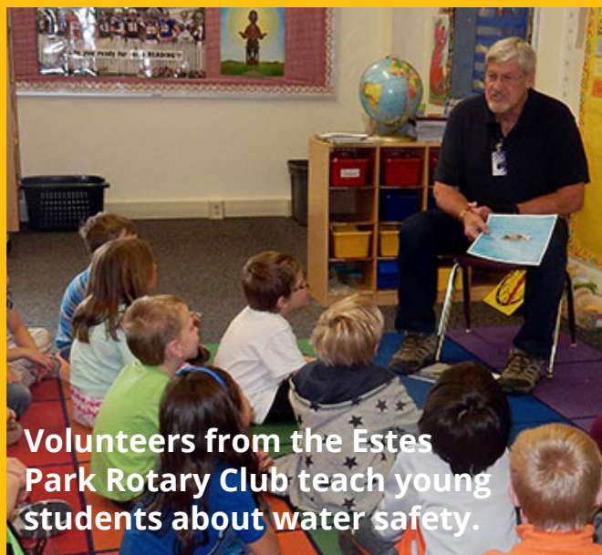
Volunteers from the Estes Park Rotary Club teach young students about water safety.