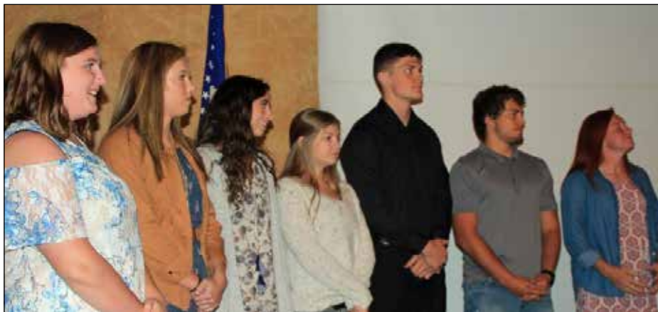
RYLA students are recognized at the September 27th club meeting.