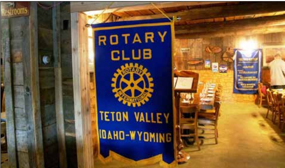
Visit 38, Rotary Club of Teton Valley. Cozy meeting room at the Knotty Pine supper club.