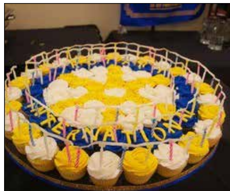
The 100 cupcake cake happy birthday to The Rotary Foundation.