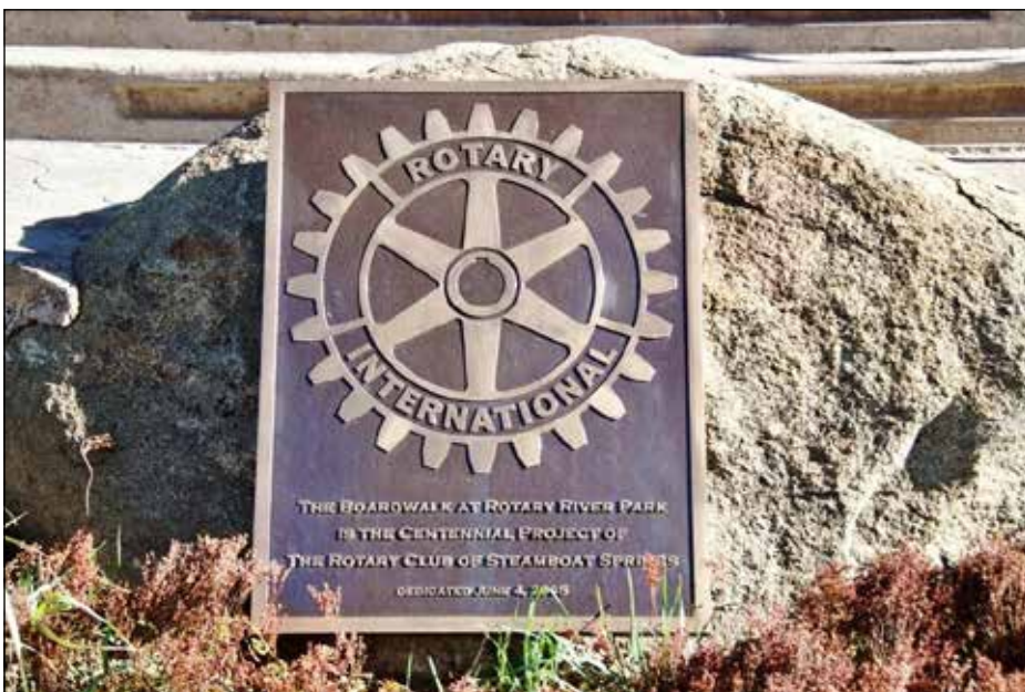
Visit 41, Rotary Club of Steamboat Springs. Plaque commemorating the Boardwalk at Rotary River Park.

of these activities include partnering with the local affiliate of Love INC to provide school supplies for the 180 local teachers to help off-set personal expenses incurred due to budget cuts.