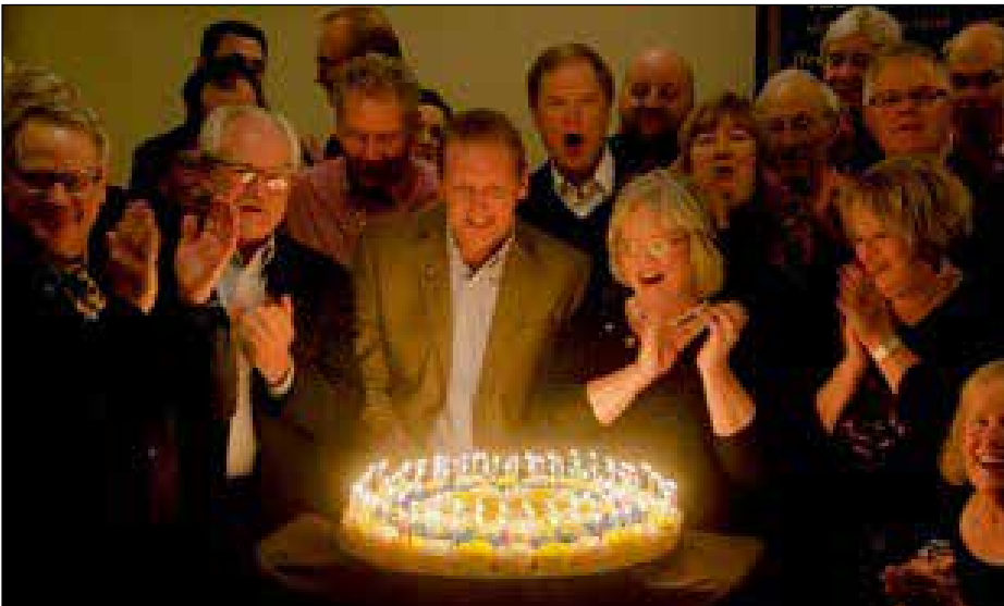
When the candles lit simultaneously it created a blaze of light and celebration.

This was a great evening for the Casper Clubs and The Rotary Foundation, which made possible all the projects presented that evening. Congratulations and thank you Rotary Clubs and the Rotaract Club of Casper for showing us how it is done.