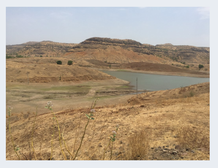
Reservoir before excavation (April 2018)