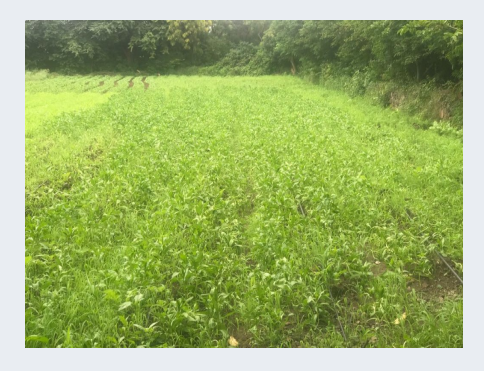
Drip Irrigated Farm in the heat of dry summer (May 2018)