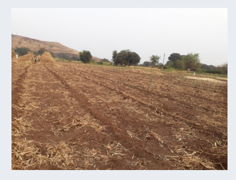
Farm before drip irrigation I installation (April 2018)