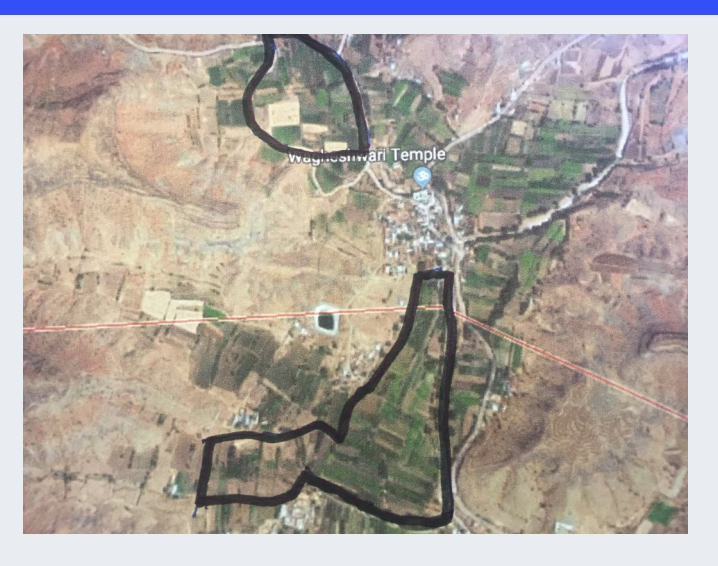
Pingori Drip Irrigated Area Overview

Economic development has raised the living standards in this village, which has also seen other Rotary projects like raised water tanks for year-round farming, tree plantations, computer labs for its school, bicycles for girl students and other continuing projects. Pingori has been transformed positively in all respects.