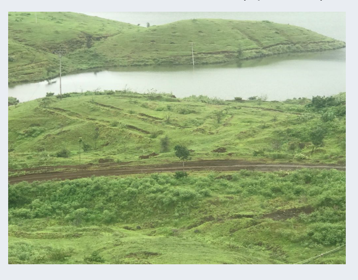
Reservoir after excavation (June 2018)