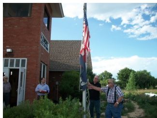
Old, worn flags being lowered