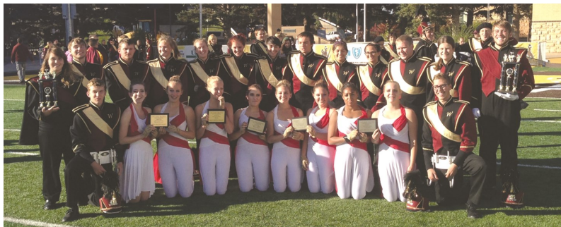
The Windsor High School Band with one of their awards.