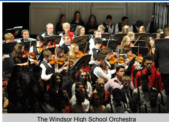
The Windsor High School Orchestra

ed flutes, trumpets, a cornet, saxophone and a violin. Music is a strong component of a student's education, including skill development, artistic expression, problem-solving and self-discipline. This initiative led by Windsor Rotarians is making a difference in the lives of these students.