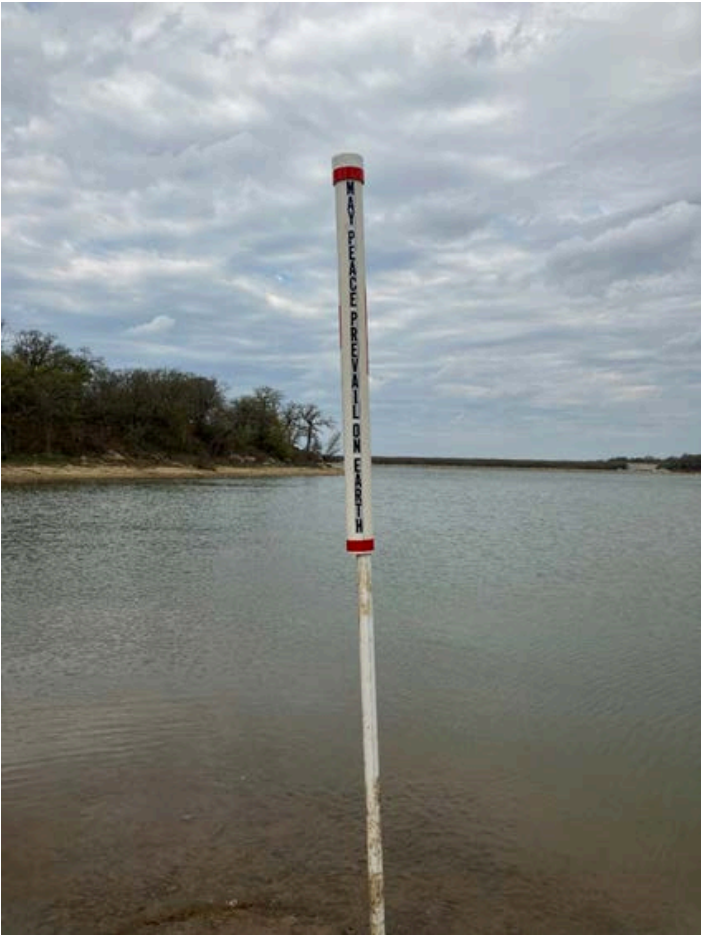
Peace Pole on Lake Nocona Nocona Rotary

Lewisville Morning Rotary donated four Promoting Peace picture books to Central Elementary School, in honor of their club speakers.