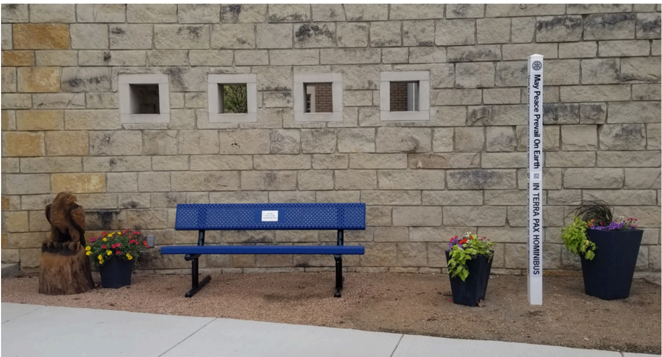
Rotary Club of Decatur Peace Garden

Burkburnett Rotary Club presented a set of the Promoting Peace Children's Books to Burkburnett Public Library and placed two in the Permian Park Storywalk. The club placed their second Peace Pole in Permian near the Rotary Pavilion.