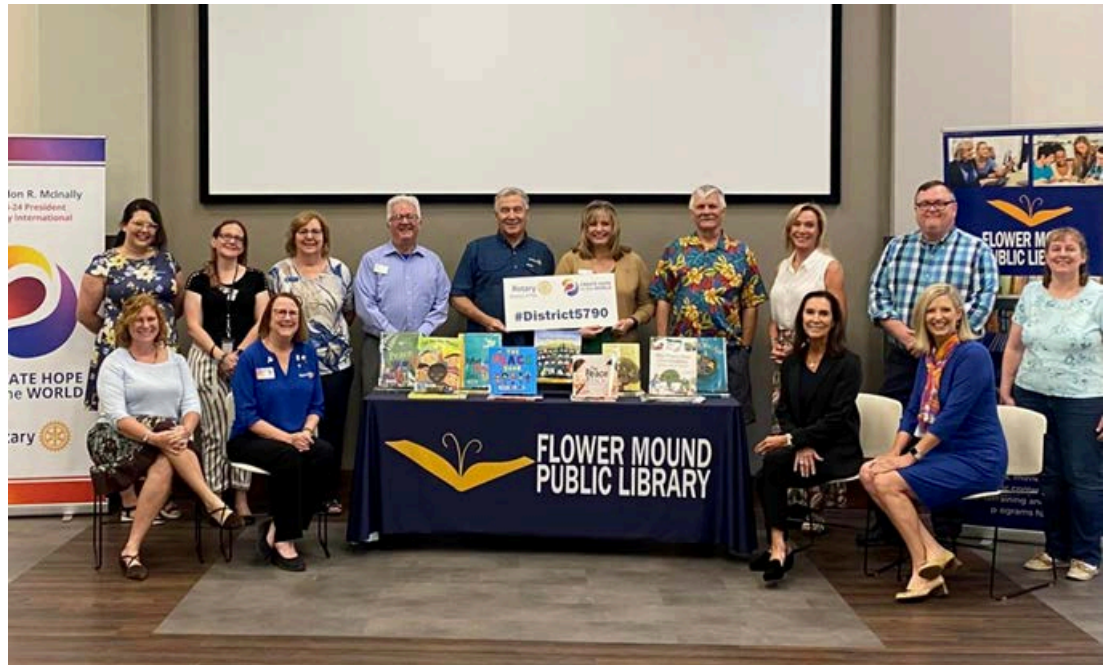
Flower Mound Public Library received three sets of the Promoting Peace Children's books, one set each from Cross Timbers, Flower Mound, and Highland Village Rotary Clubs.