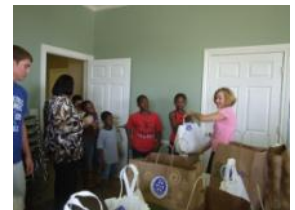
Pictures from our Snack Distribution at Artisan at Rush Creek Apartments.