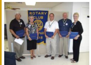
Club achieves 100% Paul Harris Fellows for 2nd Year in a Row....