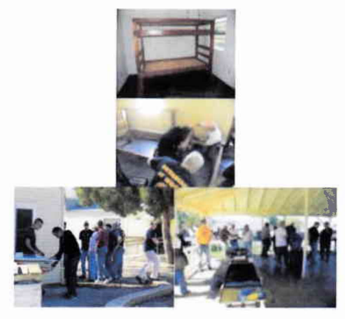
Phase in Arlington Sunrise DSG