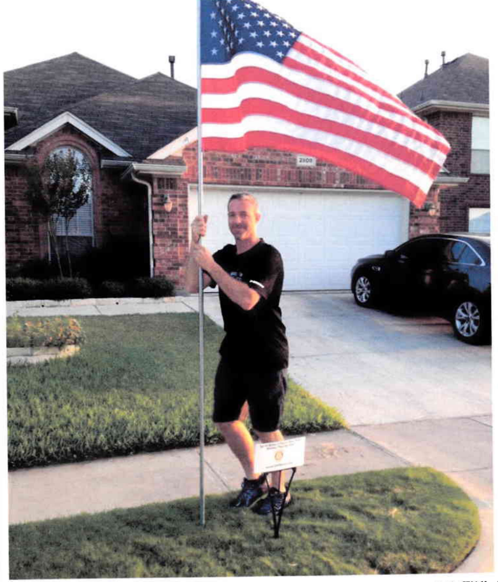
The Rotary Club of Saginaw members are active in District 5790 events. Three of our thirty-two members attended the District 5790 Membership/Foundation Seminar in Weatherford in August. Our club President Nominee attended the institute for Leadership in October. Additionally, our club might have taken the attendance prize at the Rotary Peace Conference/Foundation Banquet in November. Seven of our members were present.

The Rotary Club of Eagle Mountain-Saginaw is in its third year with their American Flag subscription program. Currently, 202 American flags are installed in yards across the Eagle Mountain-Saginaw landscape on established flag flying days.