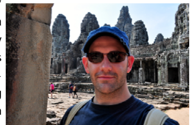
Visiting Angkor Wat, Cambodia

Because much of what the HD Centre does must be kept confidential due to the sensitive nature of the ‘live’ peace processes in which we are involved, it is actually a bit hard to talk about what exactly goes on. But for my part, one of my biggest projects during my time has been working with a team of experts from Asia, Australia, the US and Europe on an in-depth report examining Asia-Pacific peace agreements for the degree to which they include women and gender issues. A quick summary: they don’t. Unfortunately, this comes as no surprise when you learn that out of 21 major peace processes since 1992, only around 2% of the participants have been women. Women may make up half the population, may be heads of their households, may be the most vocal activists for peace, and sadly, may suffer disproportionately as victims of rape and other war atrocities. However, they continue to be left out of peace processes, which ironically give much more attention to men with guns than women with ideas.