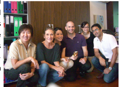
With the HD Centre Asia staff

Along with the new year, I am also beginning the final month of my internship with the Asia-Pacific regional office of the Centre for Humanitarian Dialogue. Needless to say, even just sitting here surrounded by people working on the ground in both high-level and grassroots peace negotiations across Asia has been a learning experience far exceeding anything I could have ever gotten in a classroom.