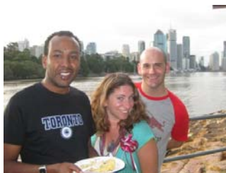
Barbequing by the Brisbane River

Needless to say, I'm enjoying every minute—including my newly undertaken studies in Peace and Conflict Resolution, attempting to learn Arabic, and bonding with my other Peace Fellows from around the world. This and more in future reports. Stay tuned!