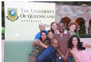
University of Queensland Class 9 Peacefellows