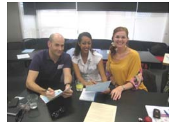
Rotary Scholars Orientation Seminar