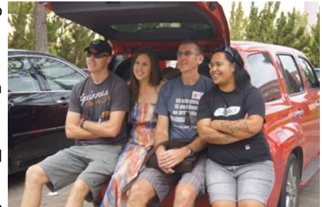
Four of the Five New Zealand GSE Team members

Our Club recently hosted a five-person Group Study Exchange (GSE) team from New Zealand. Ten of us from the Metroport, Keller, Grapevine, and Southlake Club made it out to welcome them at 11:20 p.m. on Saturday, April 9th.