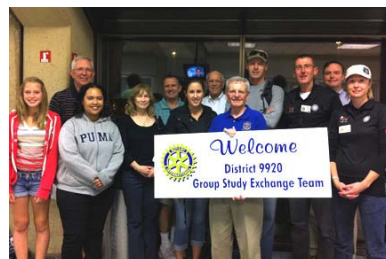
Group Study Exchange