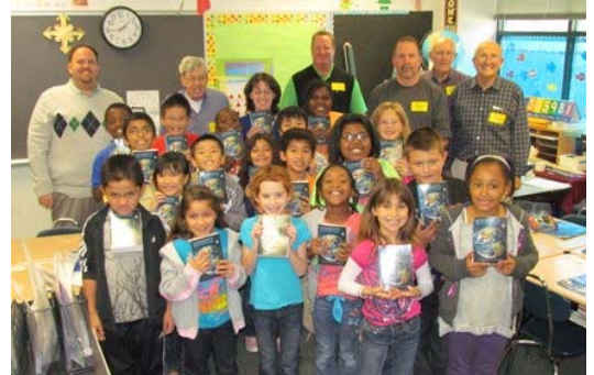
(Above) Arlington Sunrise members are pictured with students at Thornton Elementary School during presentation of dictionaries