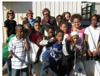
Local District Simplified Grants