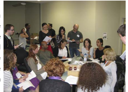
Hands-on learning: Planning a crisis response operation for our final project in Peacekeeping

As we all know, November marks Foundation Month, and I am delighted to be able to update you as a beneficiary of one of the Foundation's most innovative programs. Having seen firsthand how Rotary Peace Fellows are using the tools and skills they've learned to create currents of positive change all over the world, I can't help but be amazed and honored to be among them. The Rotary Foundation stands alone in making a truly unique investment in peace – and I believe as each class of Fellows proves, it is an investment that is rich in returns.