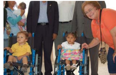
International Matching Grants