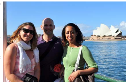
With Peace Fellows on a trip "down south" to Sydney

While at HD in Singapore, I will be working primarily with the team on implementing a new project called Women at the Peace Table, which has been started in response to a United Nations Security Council mandate to ensure that women are included in peace processes. As women often suffer disproportionately in times of conflict – due to rape and sexual violence, loss of children and livelihoods – it is vital to make sure that any peace agreement has terms that specifically address their needs.