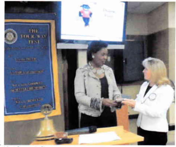
Like - Comment - Share