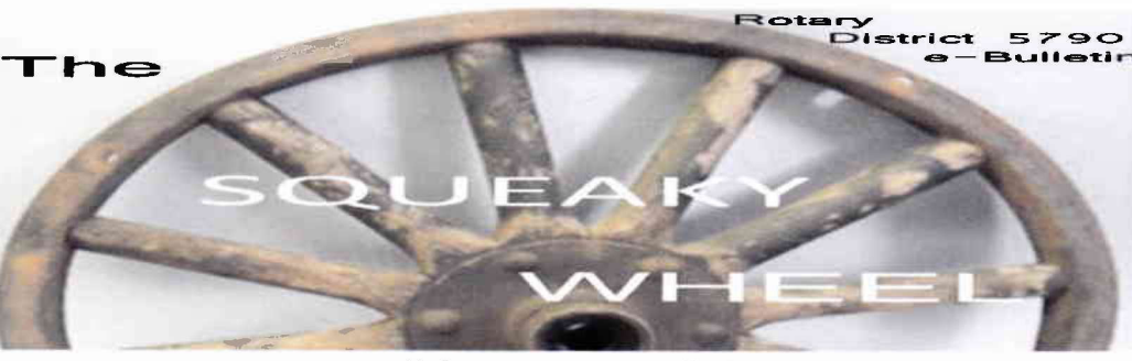
Thu Nov 14, 2013