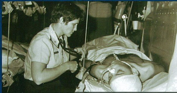
A wounded airman is assisted by a nurse aboard a U.S. Air Force medical evacuation C-141 aircraft, November 17, 1968.

Develop educational programs and materials to support the Commemoration.