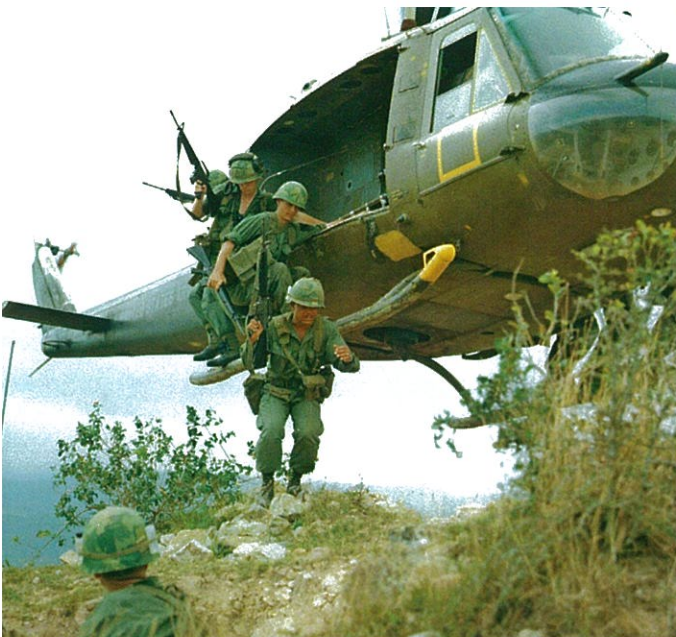
A search and destroy mission conducted by an infantry platoon of Troop B, 1st Recon Squadron, 9th Cavalry Regiment, 1st Cavalry Division (Airmobile), 3 kilometers west of Duc Pho, Quang Ngai Province, Republic of South Vietnam. Photo by SSG Howard C. Breedlove, April 24, 1967. Courtesy of the National Archives.