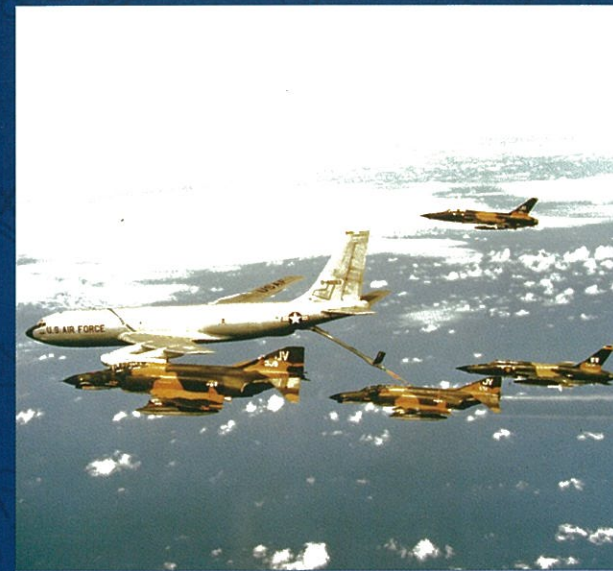
Side view of an F-4E refueling from a KC-135 as two F-105s and another F-4E await their turn. The F-4s and F-105s are assigned to the 388th Tactical Fighter Wing.

Commemorative Partners will be eligible to receive a commemorative flag, Commemorative Partner certificate and other materials and authorization to use the United States of America Vietnam War Commemorative Partner seal, without modification, for approved purposes. As stated before, events and activities must adhere to the defined Congressional objectives of the program.