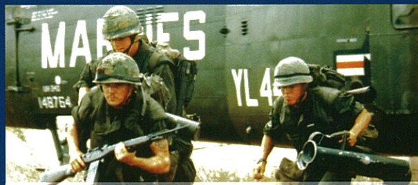
Marines disembark from an H-34 Seahorse helicopter. The amphibious assault ship USS Princeton spawned both.

The Commemorative Partner Program is designed for federal, State and local communities, veterans' organizations and other nongovernmental organizations to assist a grateful nation in thanking and honoring our Vietnam Veterans and their families. Commemorative Partners are encouraged to participate in the Commemoration of the Vietnam War by planning and conducting events and activities that will recognize the Vietnam Veterans and their families' service and sacrifice.