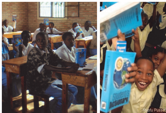
Above, kids receive dictionaries in Rwanda and Turks & Caicos Islands international projects

Contact us via email or visit our website and let us know how we can help you start a dictionary project in your area today.