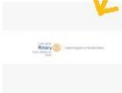
Logo Lockup Template