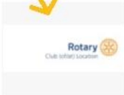
Club Logo Template