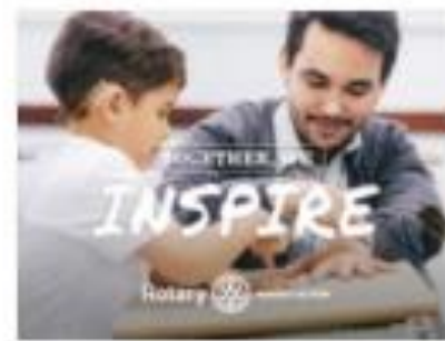
People of Action Facebook Post