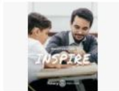
People of Action Print Ad