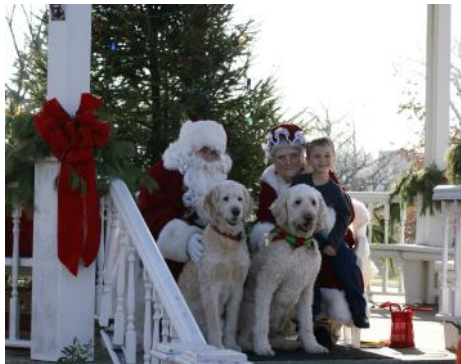
A happy boy and his dogs, giving their list to Santa