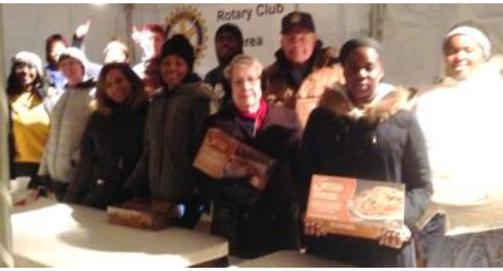
Berea Rotarians and Rotaractors from Baldwin Wallace University get ready to handout thousands of cookies and cups of hot chocolate at the Jack Frost Festival.

Berea Rotarians as well as Rotaractors and other students from Baldwin Wallace University helped Santa make an entrance to the Jack Frost Festival and Parade in Berea. The crew handed out free cocoa and cookies to the hundreds of children and adults who turned out for the nighttime festivities, which featured fireworks and the tree-lighting ceremony. Rotary estimates it went through 800 gallons of hot chocolate and 4,000 cookies. Leftover cookies were donated to food pantries. There was no leftover cocoa.