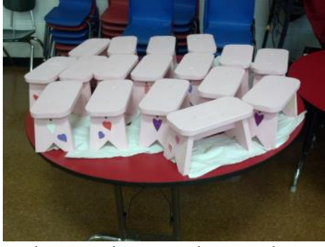
to do an article on Broadmoor and Mentor Rotary