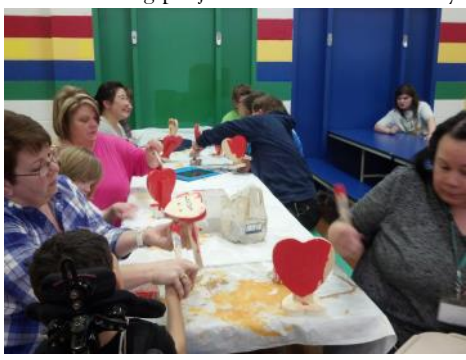
of each school month. This month the local newspaper The News-Herald decided

the kids assemble and paint and then we put heart shape stickers on each end of the stool. Mentor Rotary does these woodworking projects the second Monday