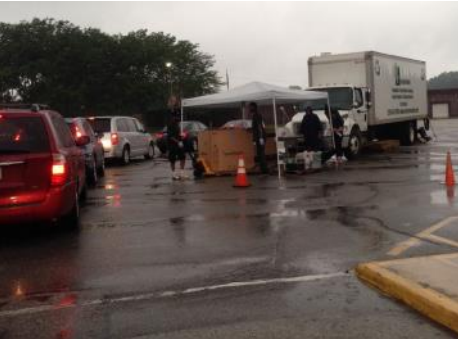
Cars lined up at early at 8:30 a.m. (the event didn't begin until 9)