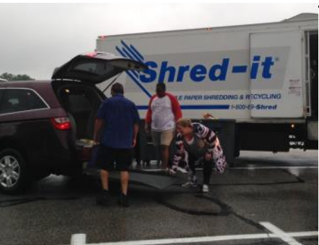
BW students help unload boxes of paper to be shredded.