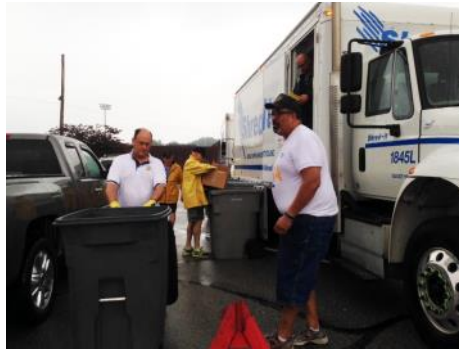
We filled two Shred-It trucks before noon.