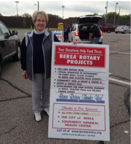
Part of the Rotary crew takes a break between customers. Sometimes Project Learn also helps