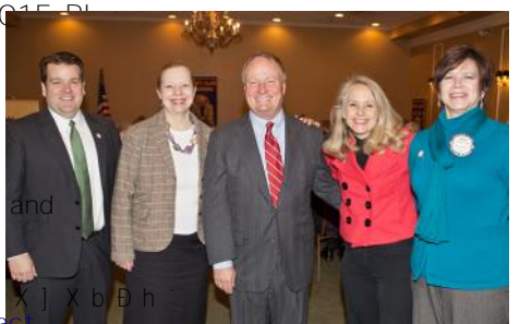
Rotary Club members

For more information about The Rotary Club of Aurora including their upcoming visit to the Western Reserve, visit their website at www.rotaryclub.org