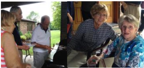
U... ) = ... k M \ )