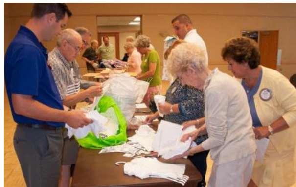
Members of the Rotary Club of Lakewood and Rocky River prepared 50 Rotary-branded layette bags to be sent to new mothers in Nicaragua.