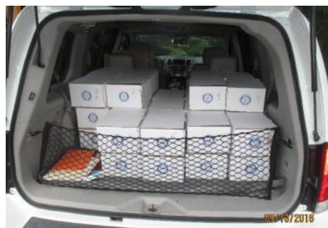
T R C P a i n e s v i l l e s e n d s 3 0 s h o e b o C h i n a n d e g a