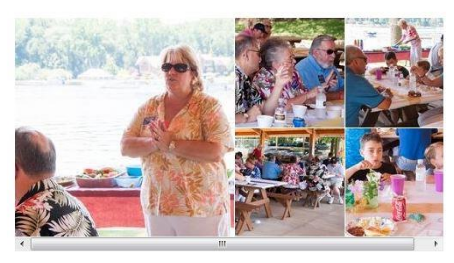
CLICK HERE TO SEE PHOTOS FROM THE DISTRICT AWARDS PICNIC