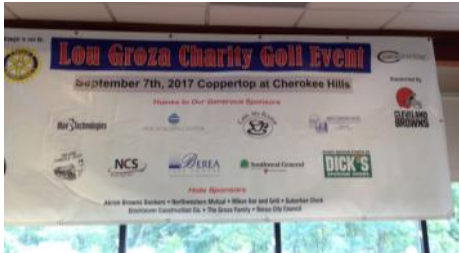
Thanks to our event sponsors and hole sponsors! You make this event possible.

day on the Coppertop at Cherokee Hills course in Valley City and at the super buffet in the clubhouse later. The Browns generously donated football gear, including a signed jersey from Joe Thomas and a football signed by Hue Jackson. Raffle items also included craft beer and lottery tickets. For more photos, go to the Berea Rotary Facebook page.