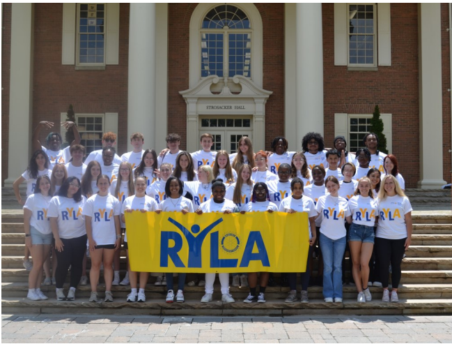
2023 Camp Photo

Can a student from your local high school picture themselves in this group shot for this year?