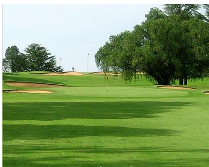
Shepparton Golf Course

REGISTRATIONS are well and truly open for the Shepparton Conference. Don't forget though that as well as registering for the Conference itself, you can also plan to join with local Shepparton Rotarians for a meal on Thursday evening, enjoy the Pre-Conference Wineries Tour, have a round of golf on Friday, visit the local Rotary market on Sunday for lunch or join the Ride to Conference crew in a few relaxing days of pedalling!! Please remember that you can also book your accommodation by following the links on the website. You can also pay your registration in instalments so please consider that as well.