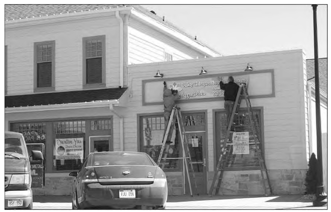
The sign for the new Valley Chiropractic & Acupuncture was being installed on March 13 on the Valley Station building, next door to Creative You Door Decor, which opened in January.