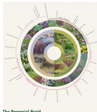
The Perennial Braid