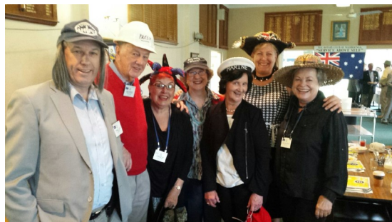
Hat Day raising money for Australian Rotary Health

Probus Clubs in D9685 with February 2016 celebrating the 40th Anniversary of Probus in Australia. Rotary's commitment and financial investment in the formation of Probus clubs is vital to the continued success of another Rotary community service activity. There are 3.5 million retirees in Australia. *The Probus membership presents 3.6% of the overall number of retirees aged 65+.[* Based on 2015 census data].