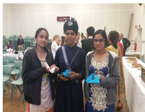
Western Sydney MUNA's Indian team

Rotary Australia World Community Services (RAWCS) continues to provide a vehicle for streamlining funding for projects and sourcing the skills and knowledge needed to carry out the tasks. Our District has sponsored 68 active programs through RAWCS this year in 24 different developing countries - 8 of these projects have been supported by The E Club of Greater Sydney. District 9685 has recently formed a RAWCS District committee to further promote the op-