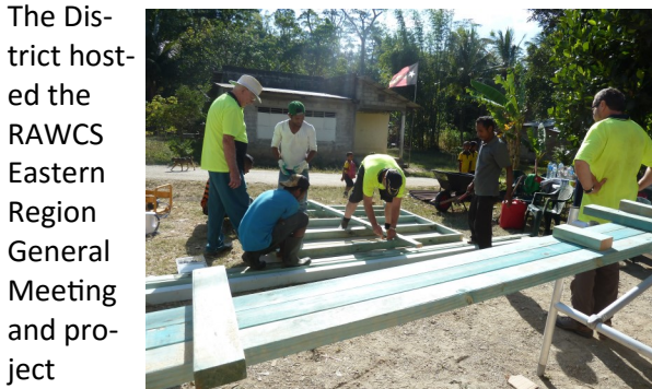
Erina Club members rebuilding the birthing centre in Timor

It has been long recognized that clubs in District 9685 hold a wealth of knowledge and expertise in initiating, developing, delivering and sustaining international projects. To encourage clubs to develop and implement International Service projects and provide advice on the benefits of RAWCS endorsement a District 9685 RAWCS Committee has been established. The committee's purpose is to provide information and advice on the opportunities available within the facilities of RAWCS and as a forum to meet and link enabling partnering of clubs to share of the load and activities.