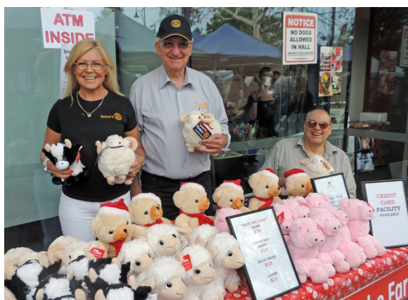
Central Blue supporting the Queensland Drought Appeal