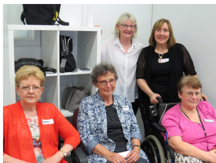
Post –Polio Seminar attendees

When the District was approached by Polio Australia to join with them in conducting a pilot program consisting of a series of seminars to educate health professionals