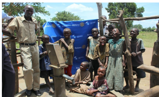
Water Pumps in Africa

Foundation funding to our clubs for District and Global Grants will exceed US$500,000 by year end, and in the three years of this program we will have received more than US$1.3 million in grant funding. Then when we add in the club's