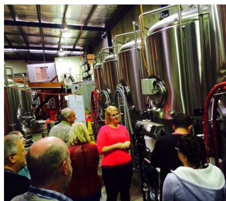
Terrigal Members enjoying a Vocational Visit to a local brewery