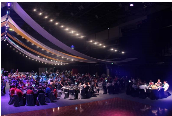
Conference Dinner, AIS

One of the components of my 'back to basics' philosophy this year was to work on strengthening the relationships between Clubs and District. As well as carrying out individual Club official visits and meeting with Club Boards in conjunction with the official visit, I felt it was important to encourage clubs to develop a special relationship with their Assistant Governor. I felt that if clubs got to really know their AG and learnt to trust him/her they would be more inclined to confide in him/her if there