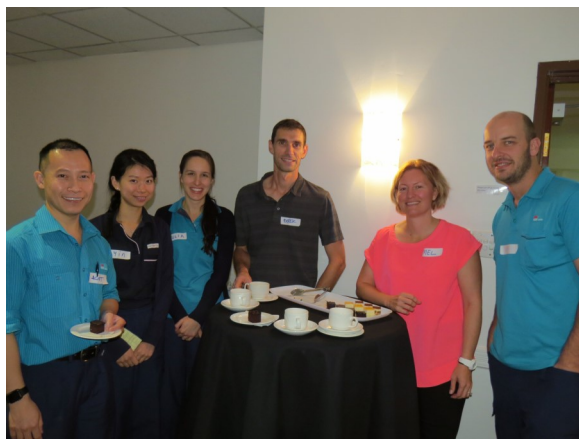
Post Polio Syndrome Seminar

Rotary International District 9685 created history in 2015/16 with the successful organisation and staging of seven Post-Polio Clinical Practice Workshops throughout the Blue Mountains and North Western Sydney – between November 2015 and