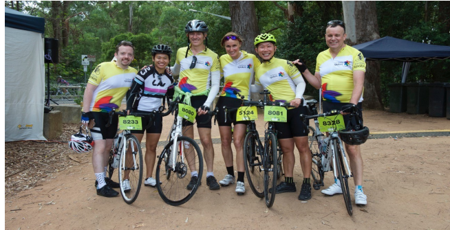
Bobbin Head Cycle Classic—Rotary Clubs of Wahroonga, St Ives, Turramurra and Kur ring gai

the Graffiti Removal Day on Oct 18. D9685 was well represented in all Zones. Bob Aiken RC Lower Blue) had been liaising with the Community