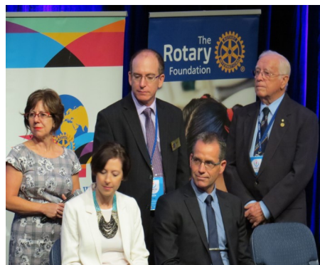
Vocational Excellence Awardees and their nominating Clubs at the District Conference

Our Rotary District again recognised three worthy recipients of a Vocational Excellence Award at our annual Conference in Canberra. Congratulations to all clubs who put forward such a wonderful calibre of candidate to be considered for this award.