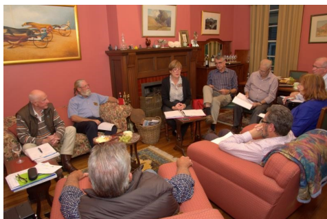
Pre-Pets Blue Mountains Zone

DA and proved an ideal location with ample parking, a 1000 seat tiered auditorium and spacious classrooms. Almost 600 members attended.