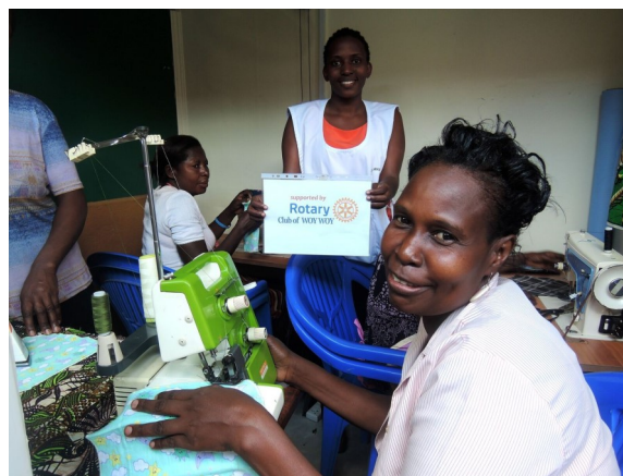
Sewing project in Africa supported by the Rotary Club of Woy Woy