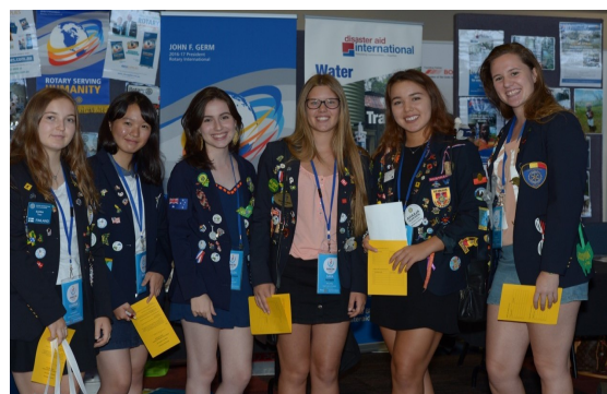
Youth Exchange Students at the District Conference

I think you get the point, but instead of just sponsoring a young person to attend a youth program, make a point of going to see them in action. It gives us the opportunity to see with real clarity that the young people are outstanding members of the community and as I have heard before, they are not the future, they are the now.