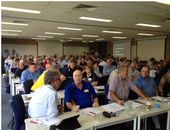
PETS Training at Macquarie Graduate School of Management