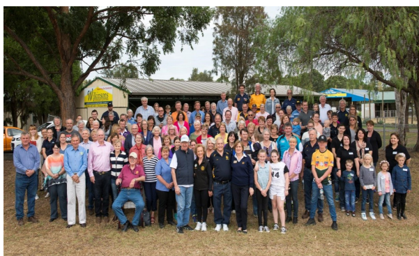
RC Richmond's Beneficiaries & Benefactors Luncheon

Community activities in D9685 have been the 'heart beat' of Rotary in 2015-16.