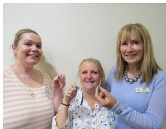
New Centurions showing their badges (above) and the Centurion Pole (right)

was presented with her Award on Rotary International Day at the United Nations in New York in December.