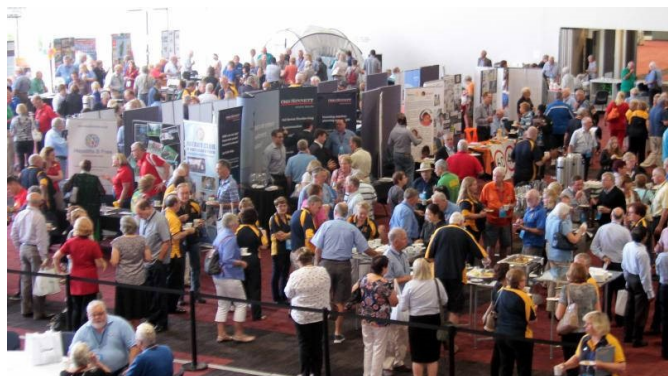
House of Friendship, District Conference

As 2016 is an Olympic year I selected a sporting