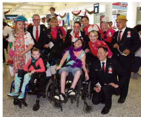
Turramurra's Jumbo Flight

As always, our Clubs have been very active across all Avenues of Service during this year. The huge variety of projects and the level of hu-