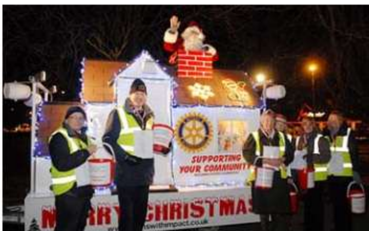
Each year the club's carol float raises money for Vale charities

above self'. If you'd like to put something back into your local and international community while meeting new friends then it can be very rewarding. Younger professionals will gain experience in project management and other skills they can use back in the workplace. Our club is relatively informal, has plenty of lady members and we also have a number of couples who are both members.