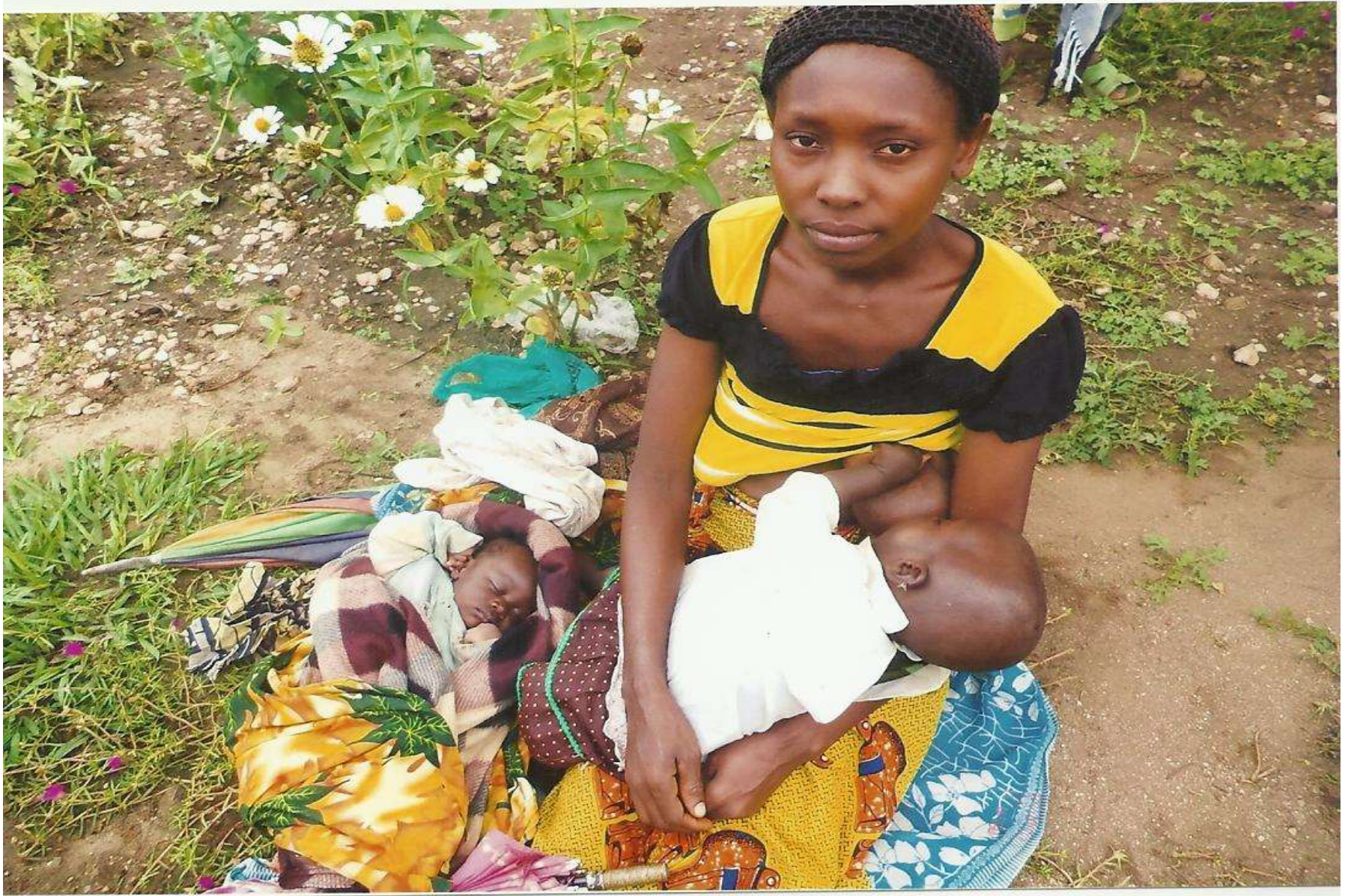
DISPLACED WOMAN AND HER CHILDREN