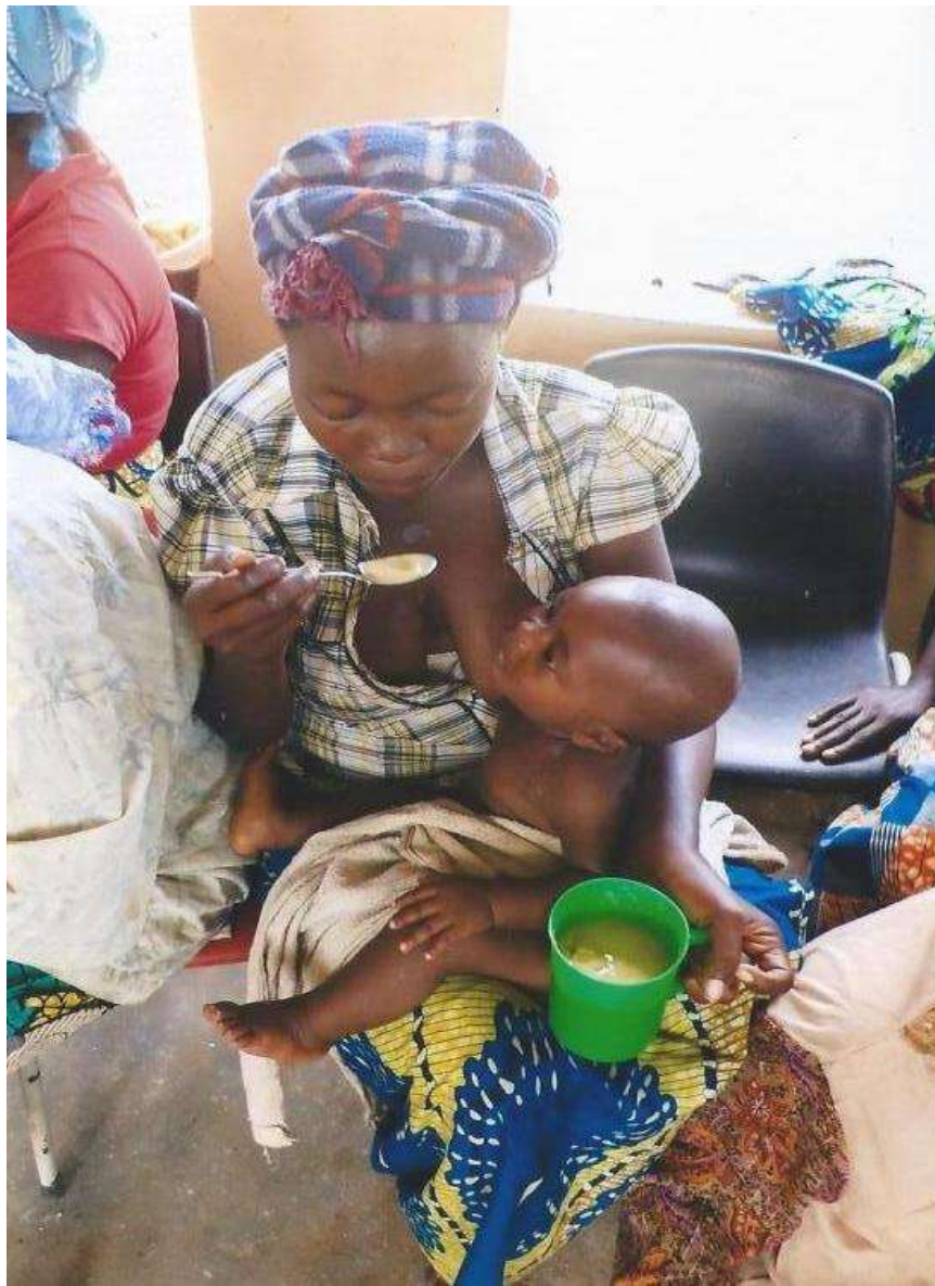
BEFORE MOTHER GIVING PORRIDGE TO A CHILD