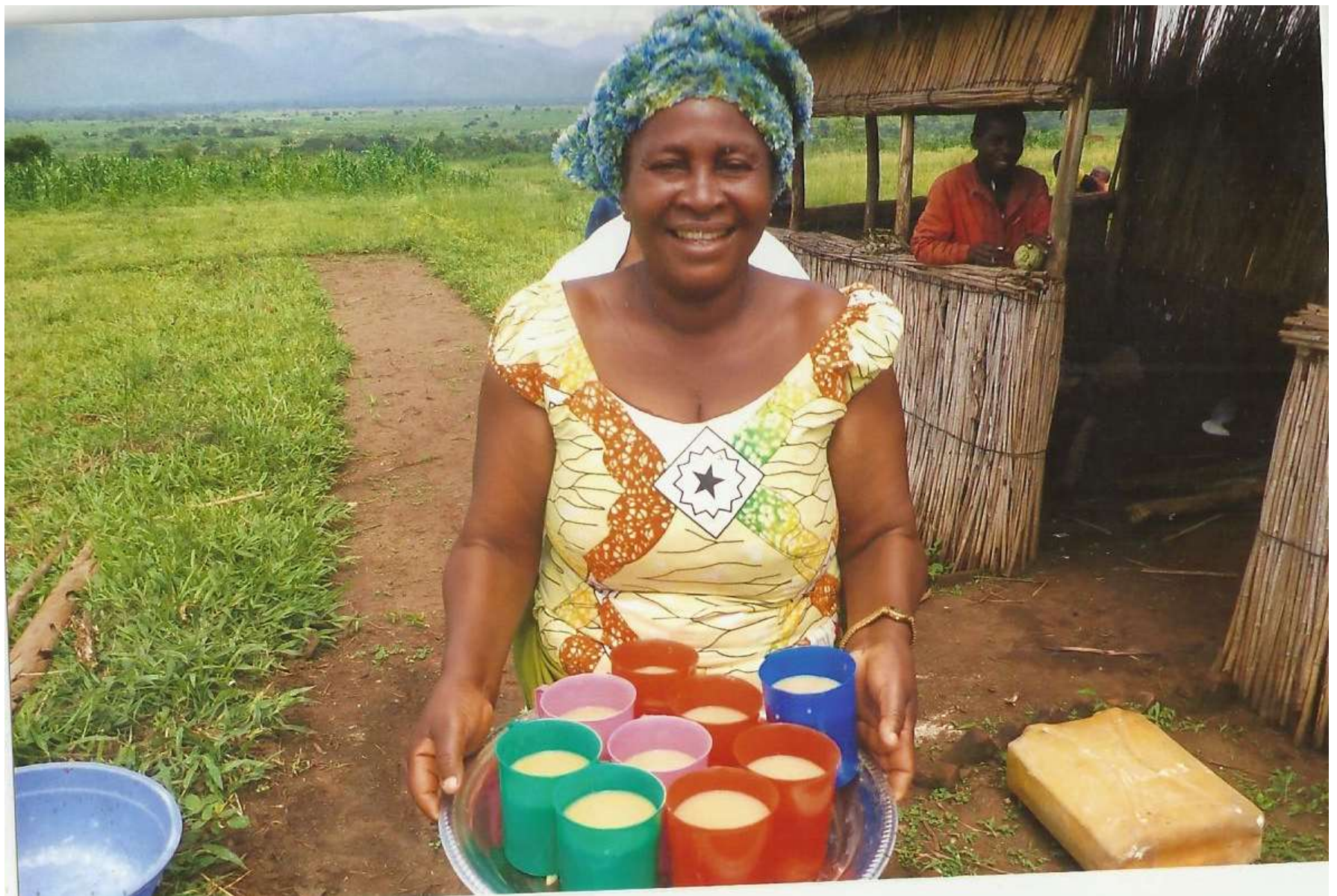
MHCD STAFF CARRYING PORRIDGE FOR DISTRIBUTING AMONG THE CHILDREN