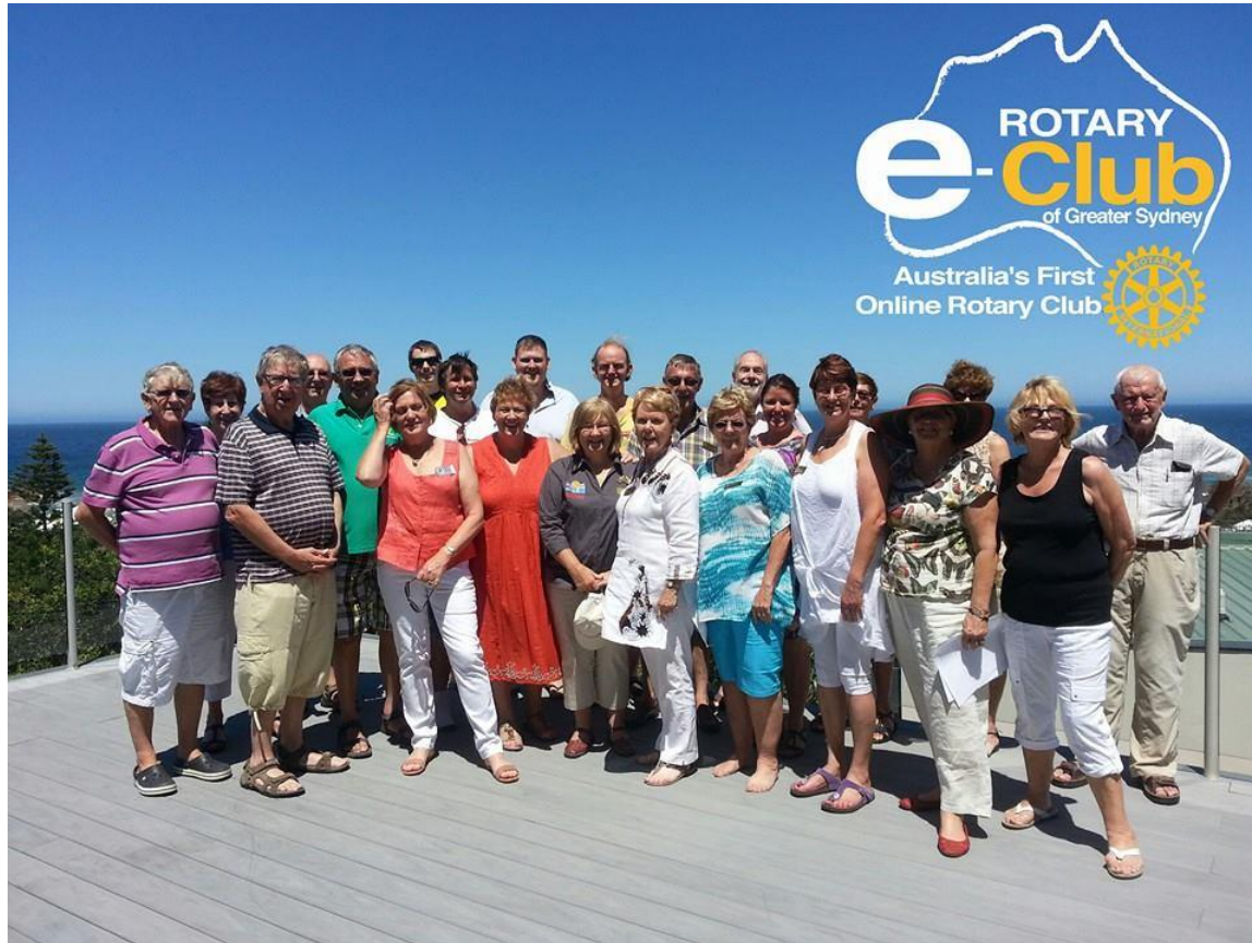
Members and friends