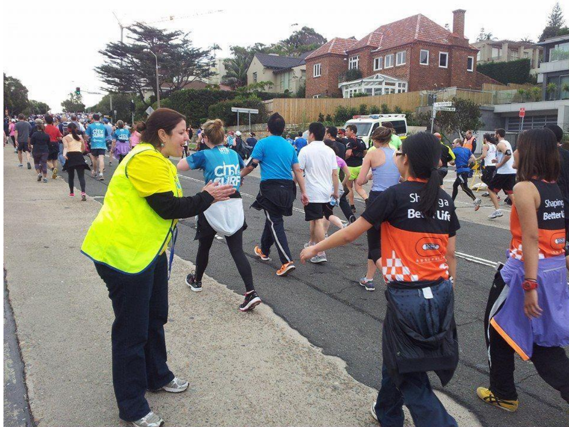
City to Surf with RC Rose Bay & Bondi Junction