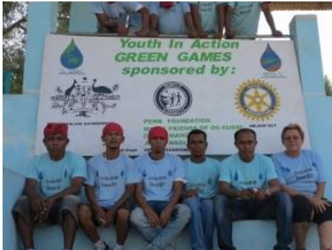
The Green Games – Timor Leste