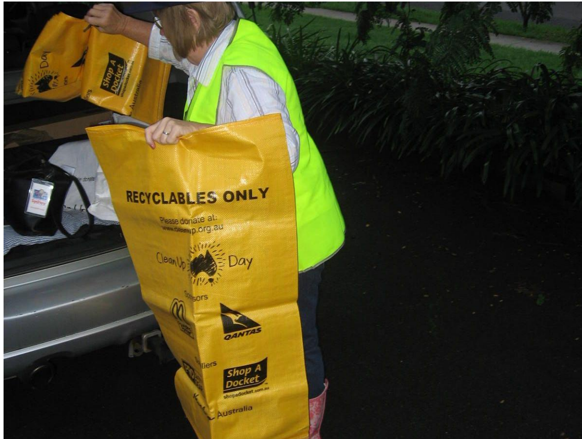
Clean Up Australia