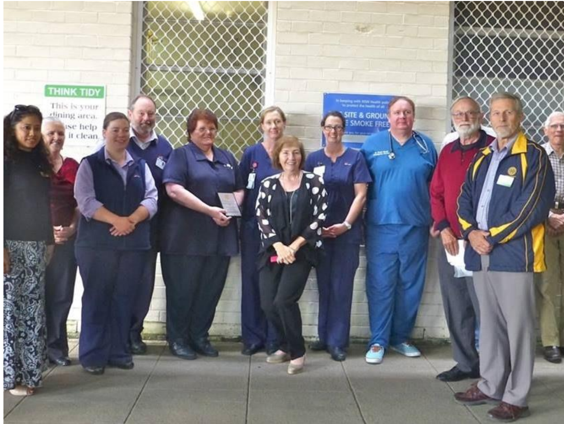
Vocational Service Award – Bega Hospital