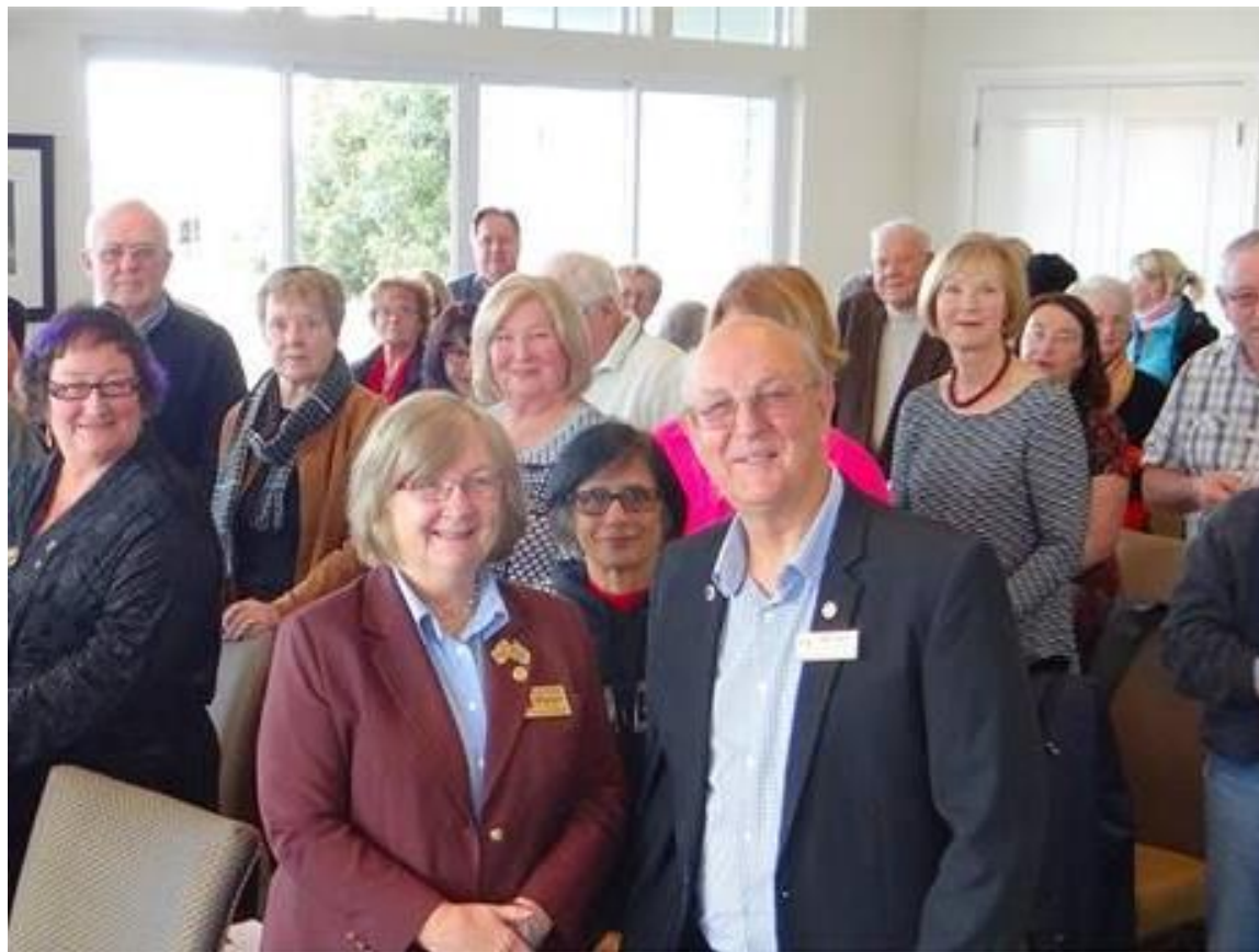
Charter Probus Cabarita –Breakfast Point