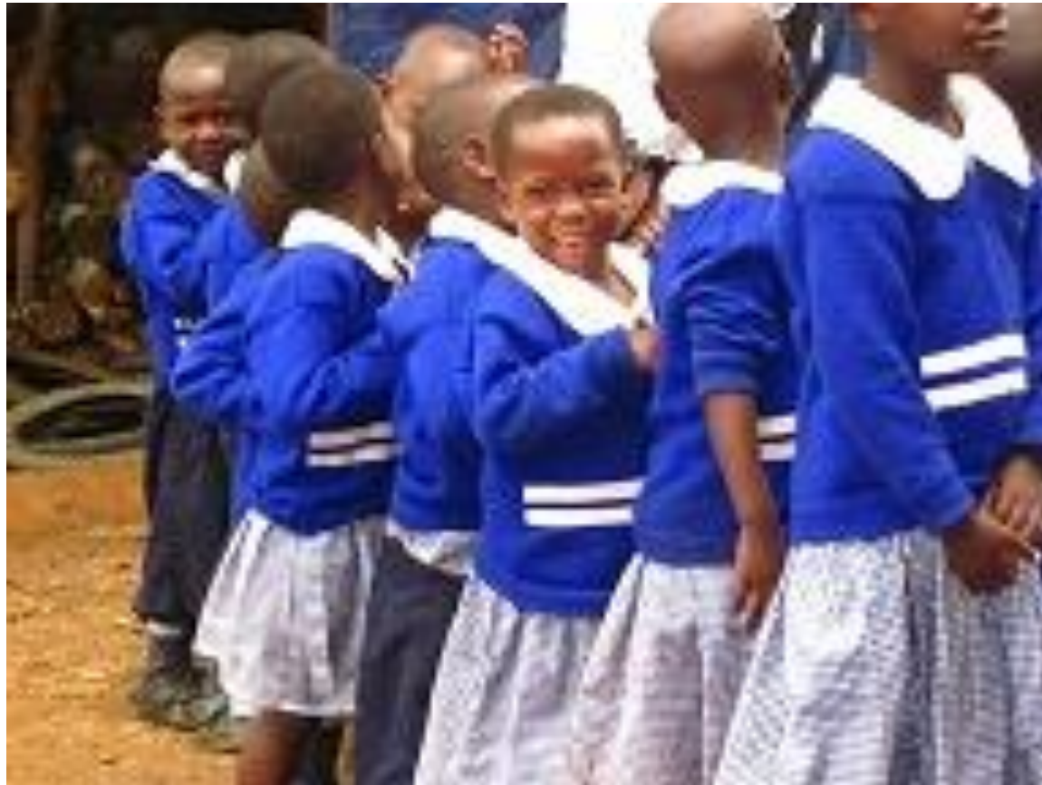
Katuuso School, Uganda