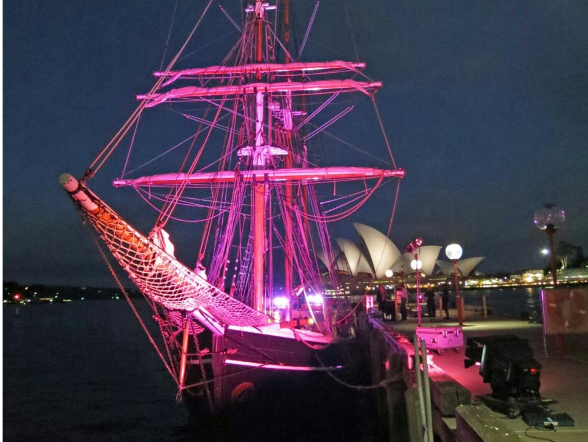
Tall Ships event during Sydney Convention