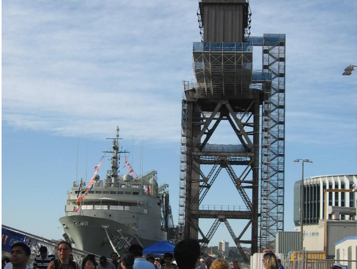
Fleet BBQ with RC Kings Cross & Darling Harbour