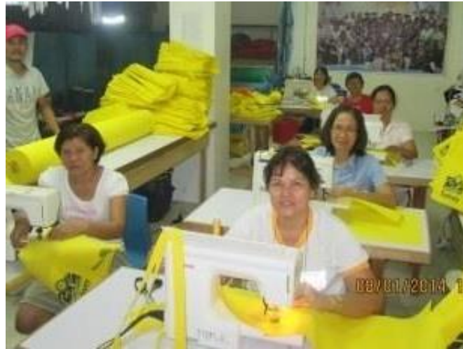
Sewaïd Team – Philippines sewing the 20,000 satchels for the Sydney RI Convention