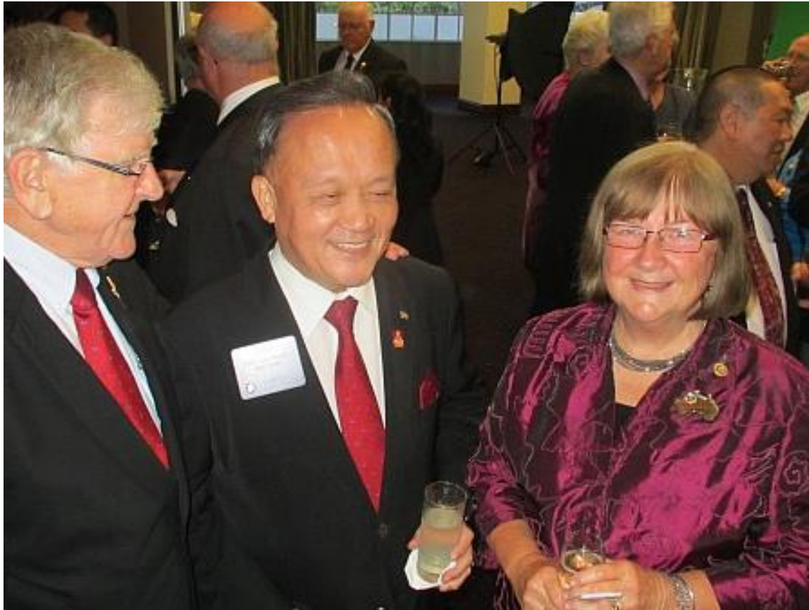
The Rotary Foundation Dinner