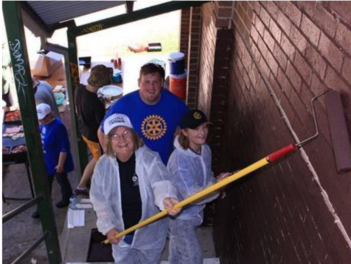
Graffiti removal at Scout hall