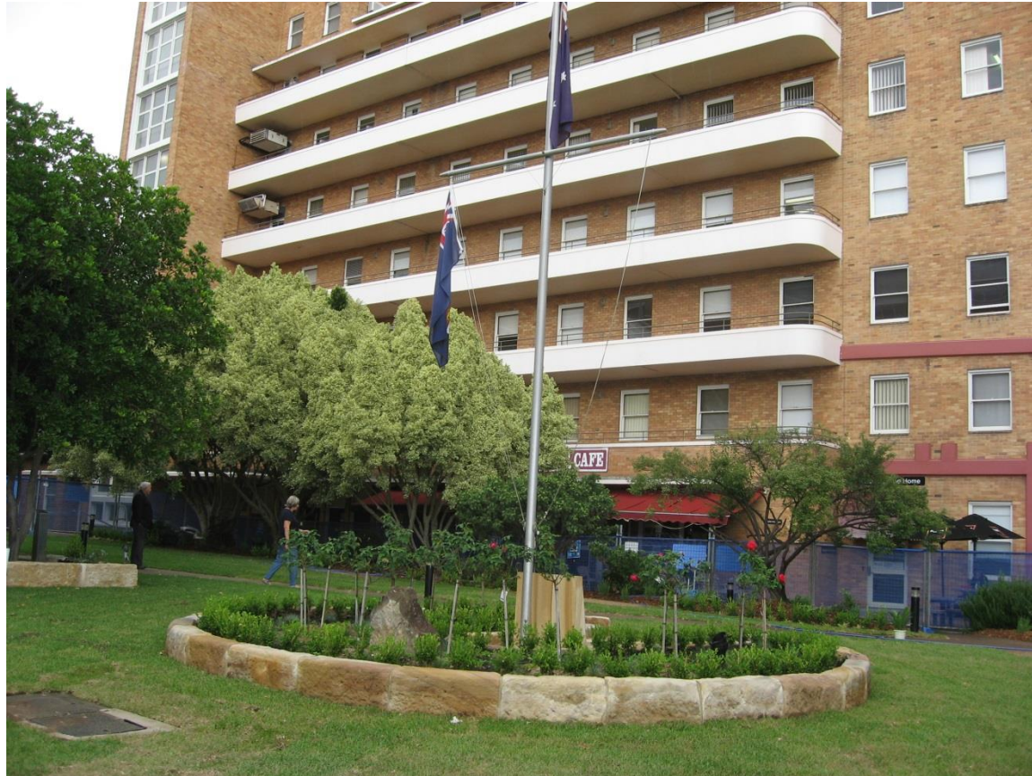
Rotary ANZAC Garden at the Repat Hospital Concord