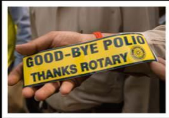
What my family thinks I do