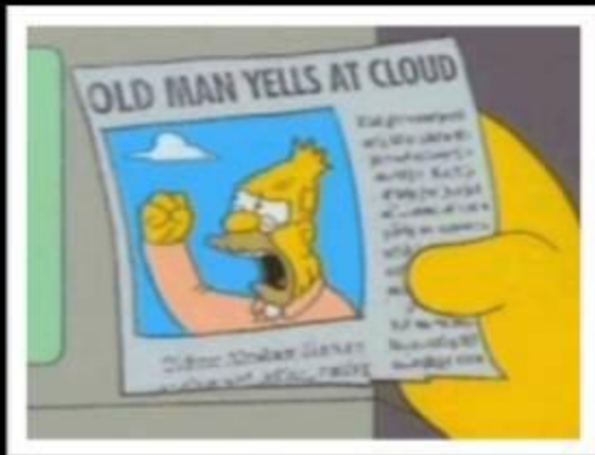
What young people think I do