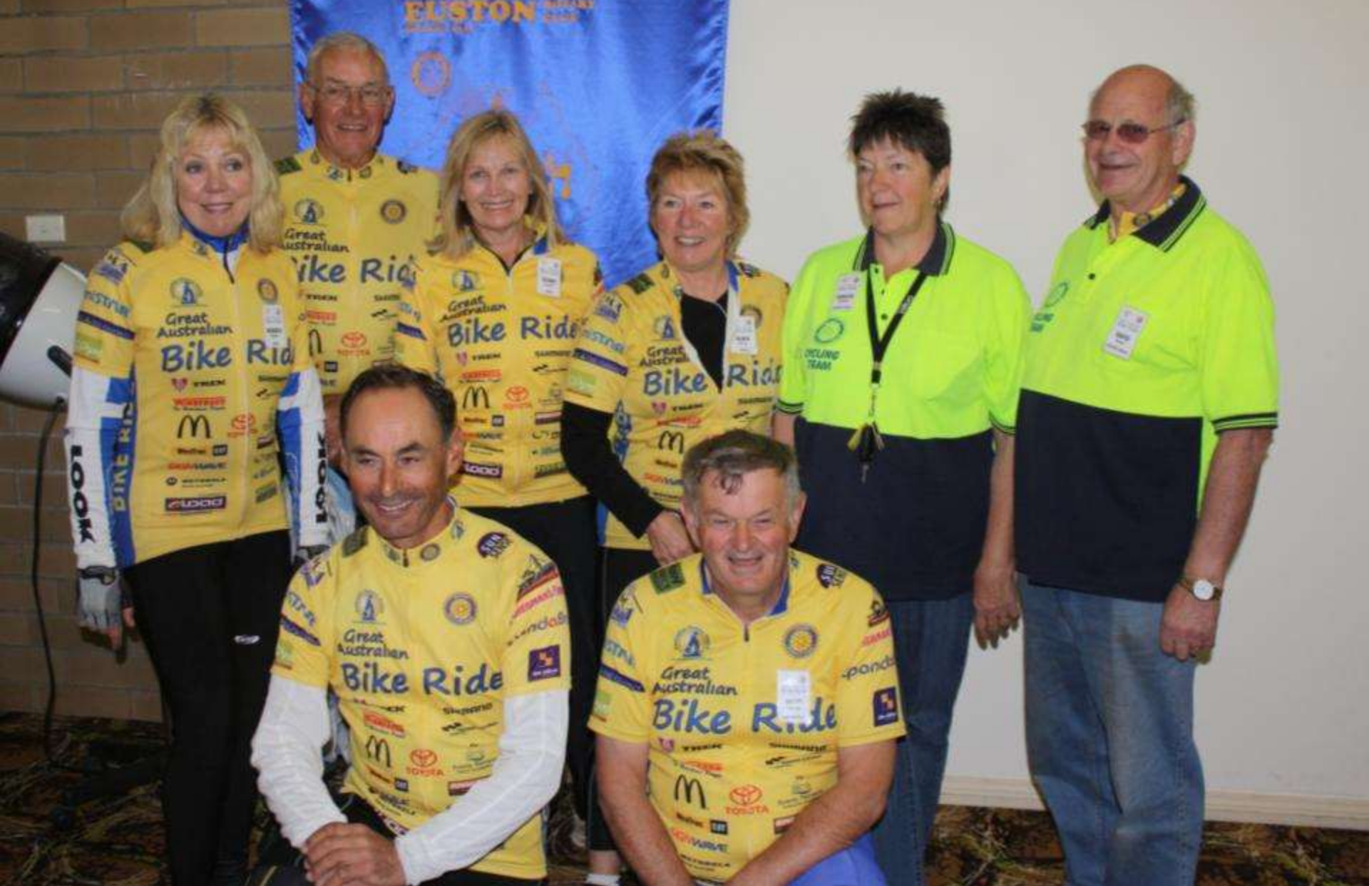
Core Team on the Bike Ride