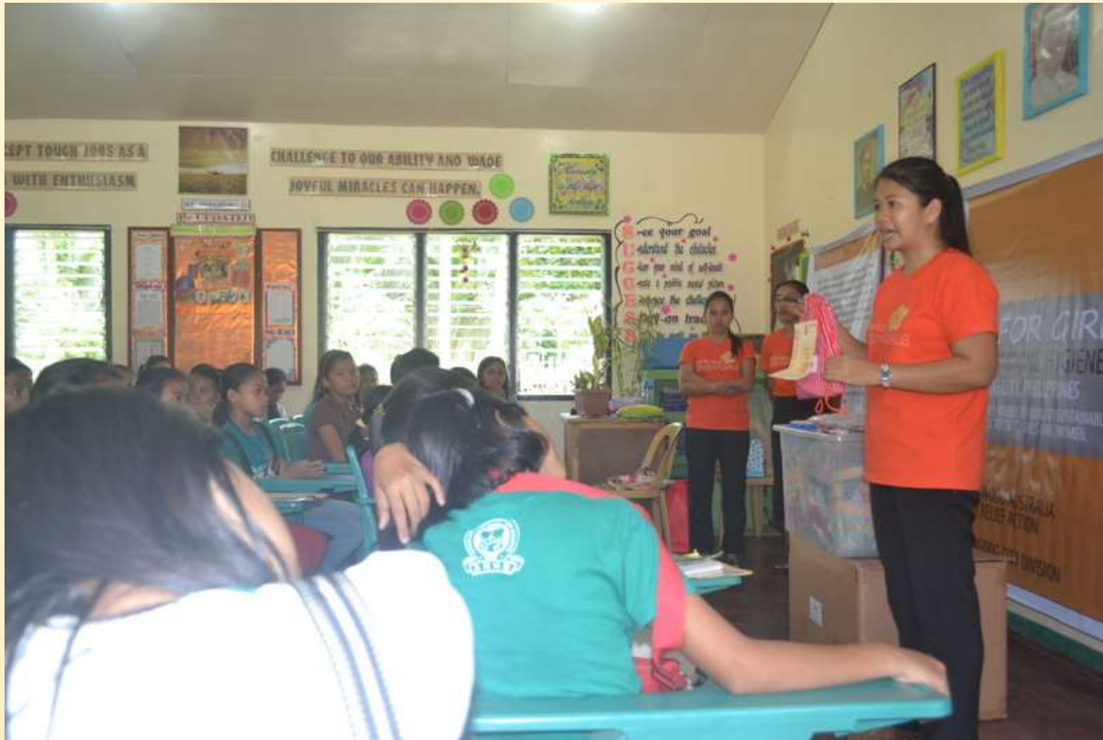
Presenting the DfG kits to the girls