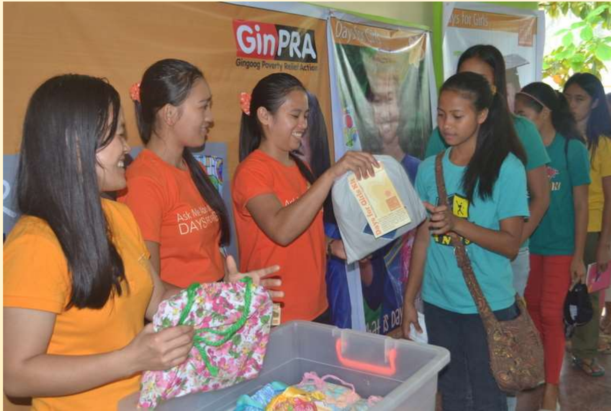
DfG kits distribution