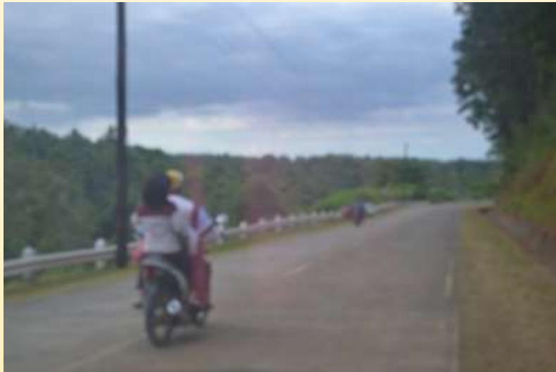
Main road condition

Sulpicio Lugod Elementary School is located in the outskirts side of Gingoog, around 40 minutes ride due to the very rough and hilly road.