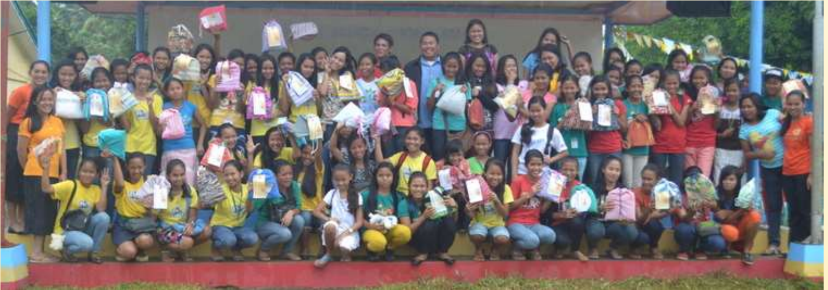
The girls with their DfG kits