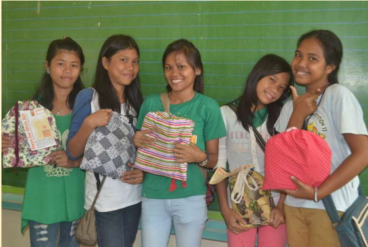
The girls with their DfG kits