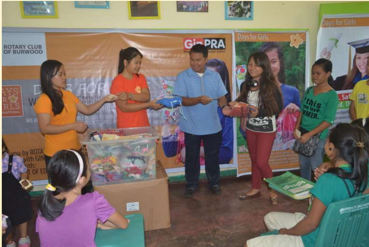
DfG kits distribution with the School Principal.