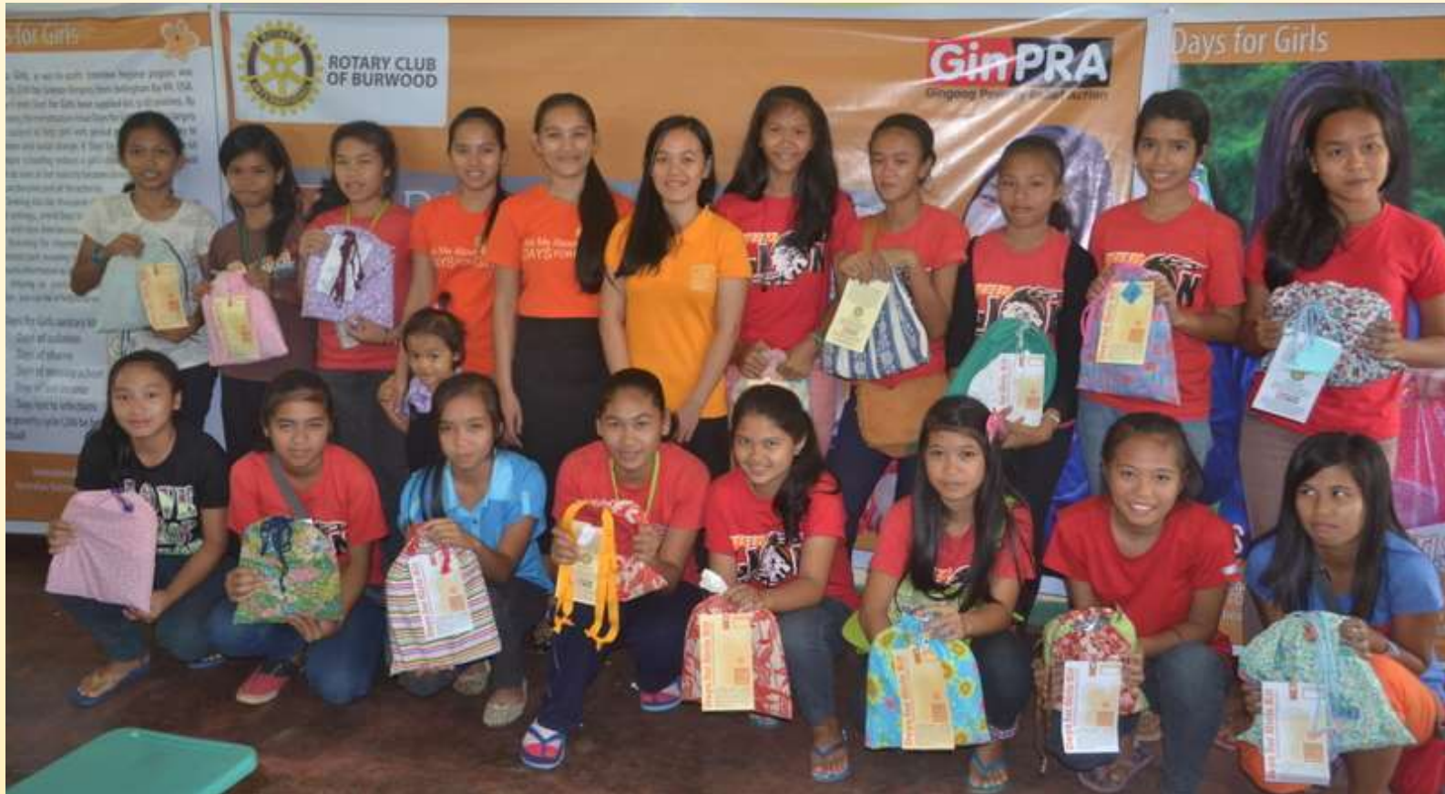
The girls with their DfG kits