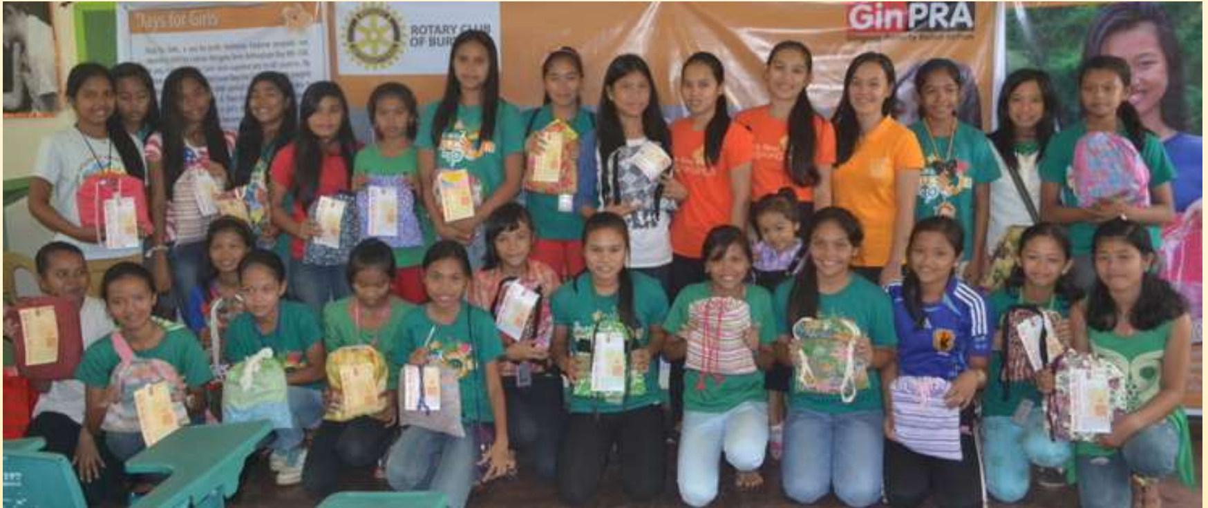
The girls with their DfG kits