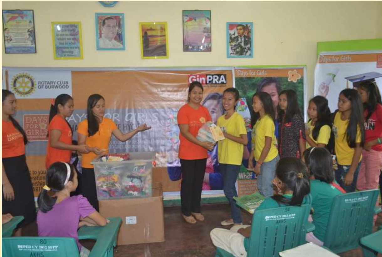
DfG kits distribution