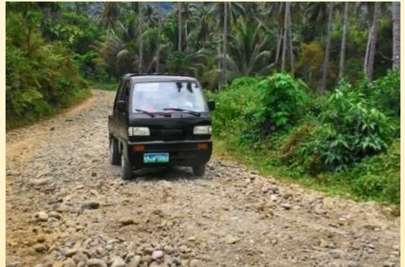
Barangay road condition