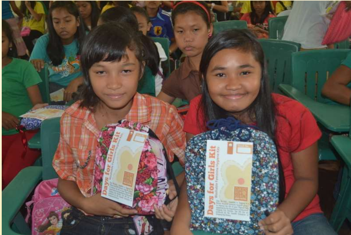
The girls with their DfG kits