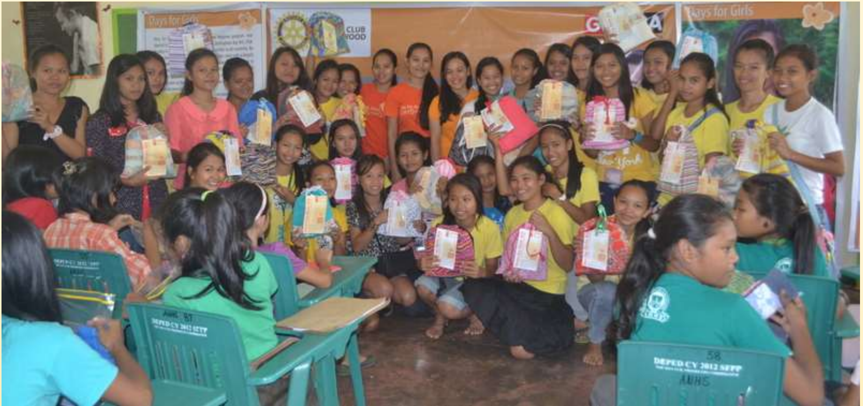
The girls with their DfG kits