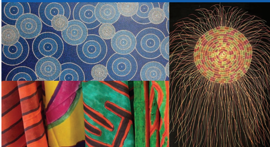
These are some of the many beautiful Indigenous products and artworks that will be on display and curated by the Tali Gallery during the Convention.

One of the highlights at the Rotary International Convention within the Billabong House of Friendship will be a diverse display of Australian Aboriginal Art and Culture curated by Tali Gallery.