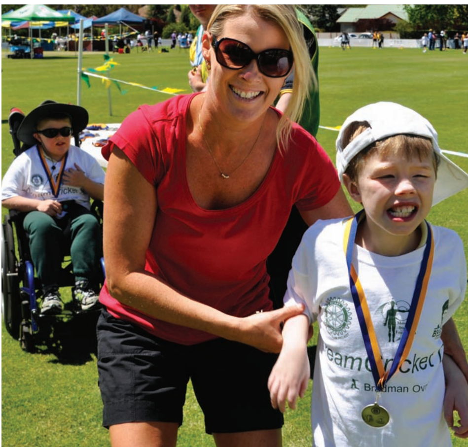
A day filled with fun and excitement as physically and intellectually challenged children enjoy the DreamCricket Festival held at Bradman Oval in Bowral hosted by the Rotary Club of Bowral Mittagong. Don't miss the DreamCricket demonstration at the Great Aussie Barbecue on June 1.

Up to four trains an hour – from 7 am to 10 pm – will ensure efficient, comfortable movement of the expected large crowds.