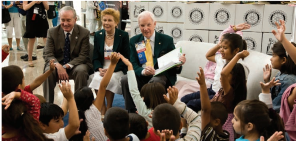
Scene from the literacy project conducted in conjunction with the Los Angeles Convention in 2008, featuring Past RI President Wilf Wilkinson.

A 'reminder' flyer will be presented to all Rotarians as they collect registration details in the Convention Registration area – Hall 5 in the