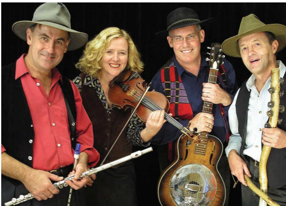
Members of the Reel Matilda Band pictured above, holding a collection of some of the unique and interesting instruments they use in their performances.

The Reel Matilda have also supported other famous and iconic Australian musicians and entertainers such as Redgum and John Williamson. Over the period of their success they have managed to clock up some three hundred "gigs" as well as release their first recording.