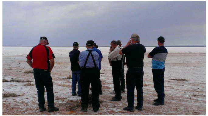
Why did they choose this desolate area ??