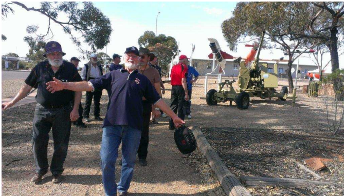
Bryant explains the Rocket display