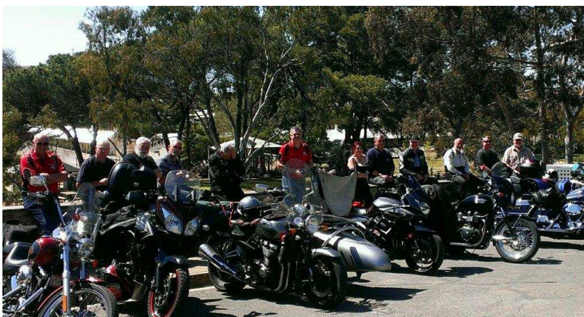
The total group gather for a welcome breather at Burra Burra, SA