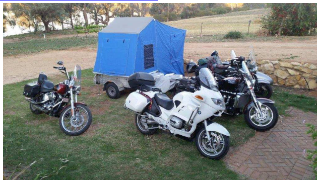
Victorians invade Moyle Ranch, SA and set up semi-permanent camp