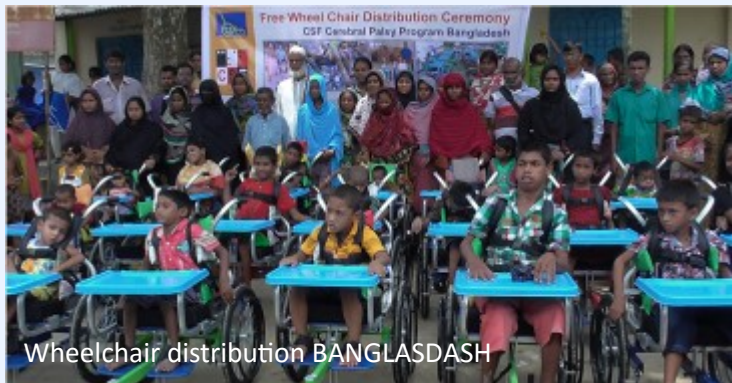
Wheelchair distribution BANGLASDASH

Facilitating the delivery and installation of wheelchairs from "Wheelchairs for Kids".