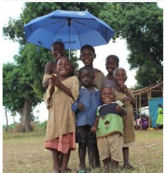
Above: Nabirye community, UGANDA

The present requirement for the Regional Coordinator to request a report will cease and there will be no requirement to upload the report to the volunteer website.