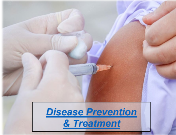
Disease Prevention & Treatment