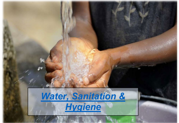
Water, Sanitation & Hygiene