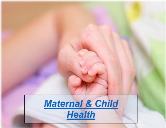
Maternal & Child Health