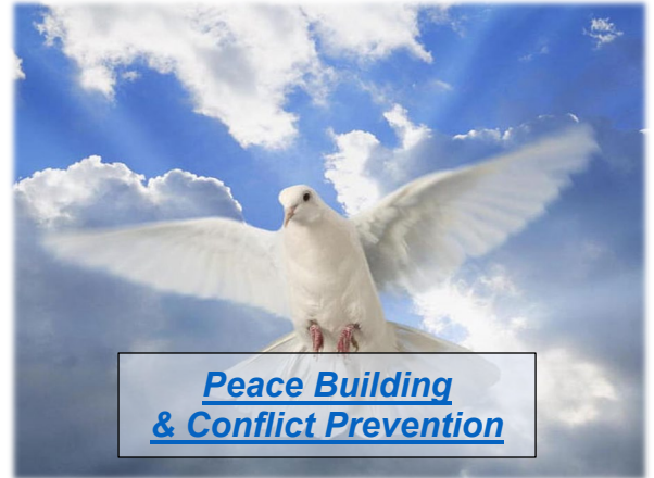
Peace Building & Conflict Prevention