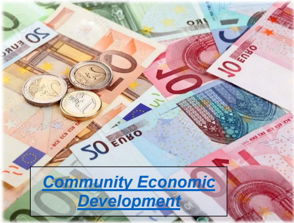
Community Economic Development